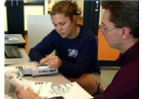
Image Quality Analysis HP 130 and Epson 7600