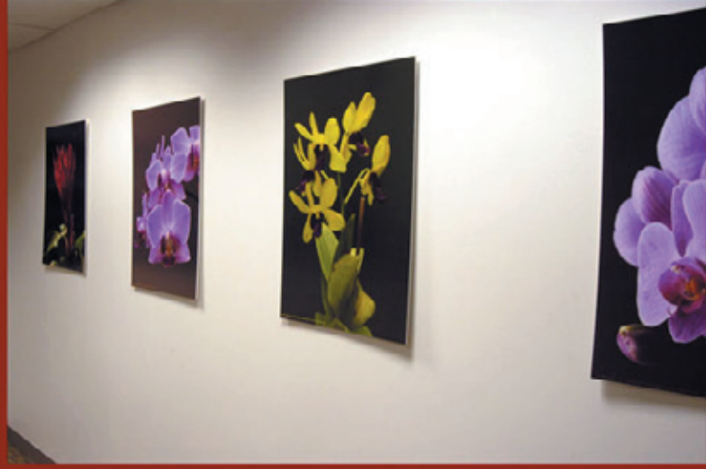
Gallery room #1