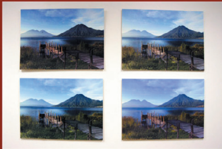
Gallery room #2