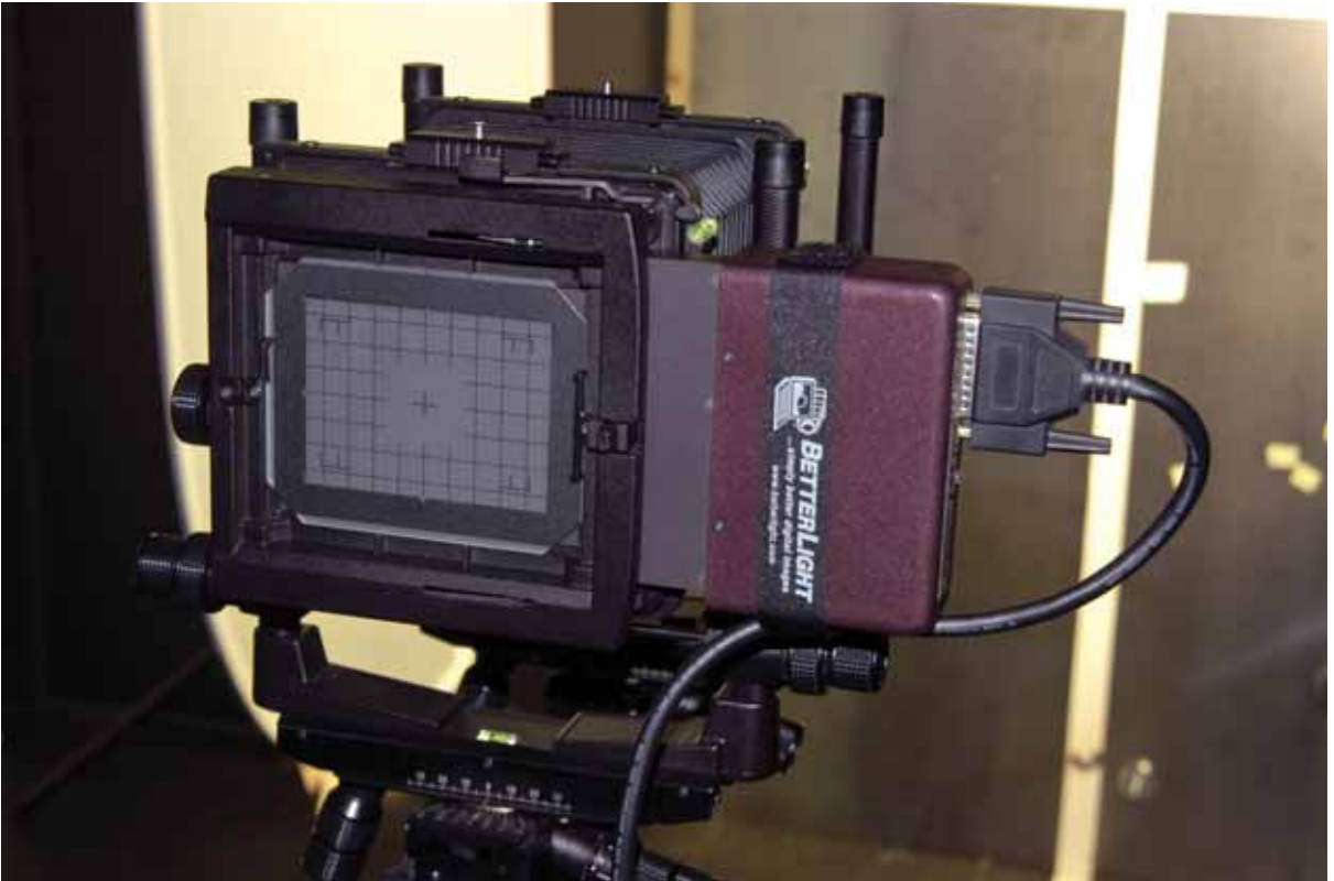
BetterLight digital back inserted into a Cambo Legend 4 x 5 camera. Cambo cameras are made in the Netherlands, and available exclusively from Calumet Photographic. BetterLight cameras can be obtained directly from BetterLight.