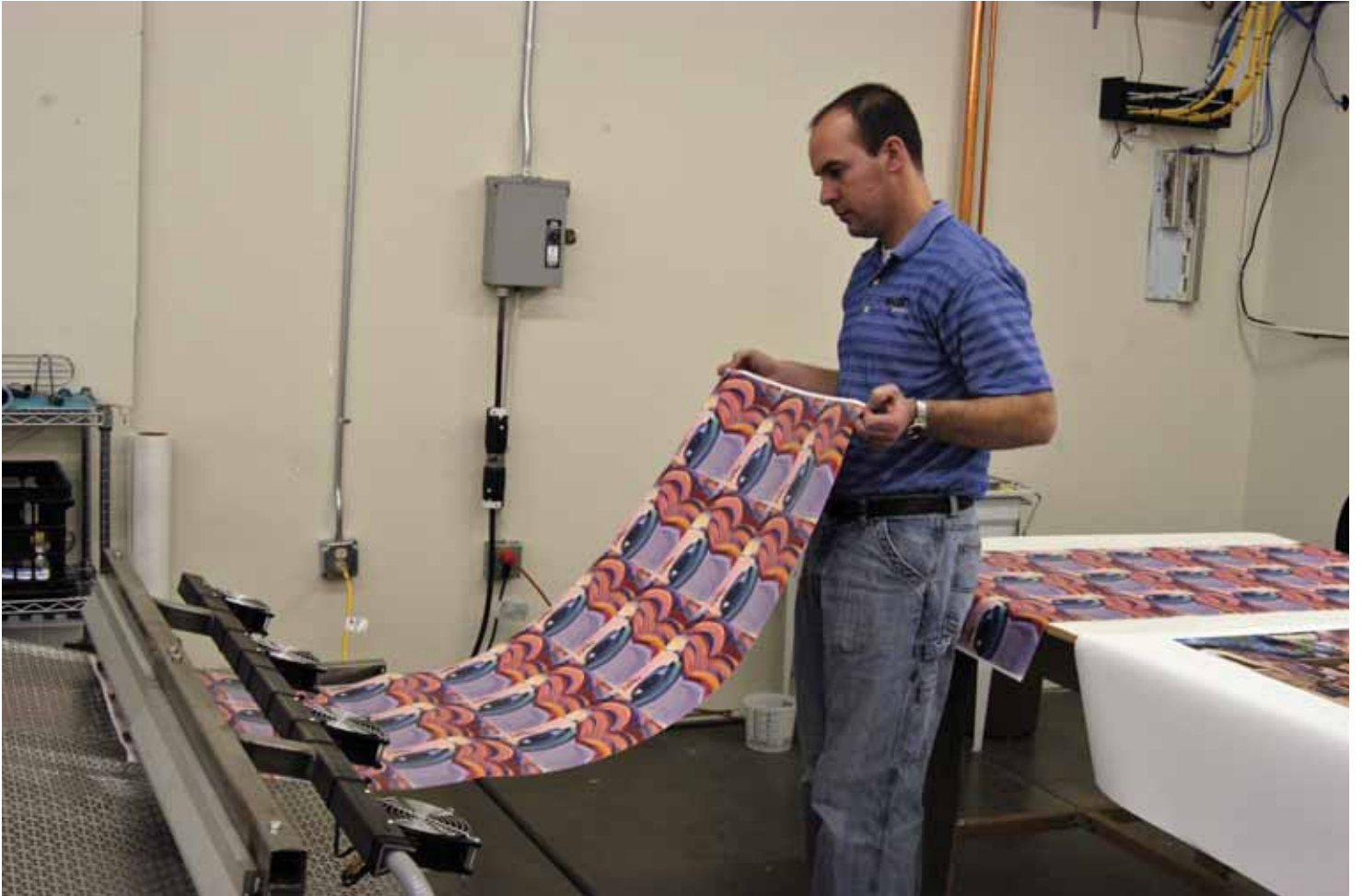
Liquid laminating with equipment from Lumina, in Canada.