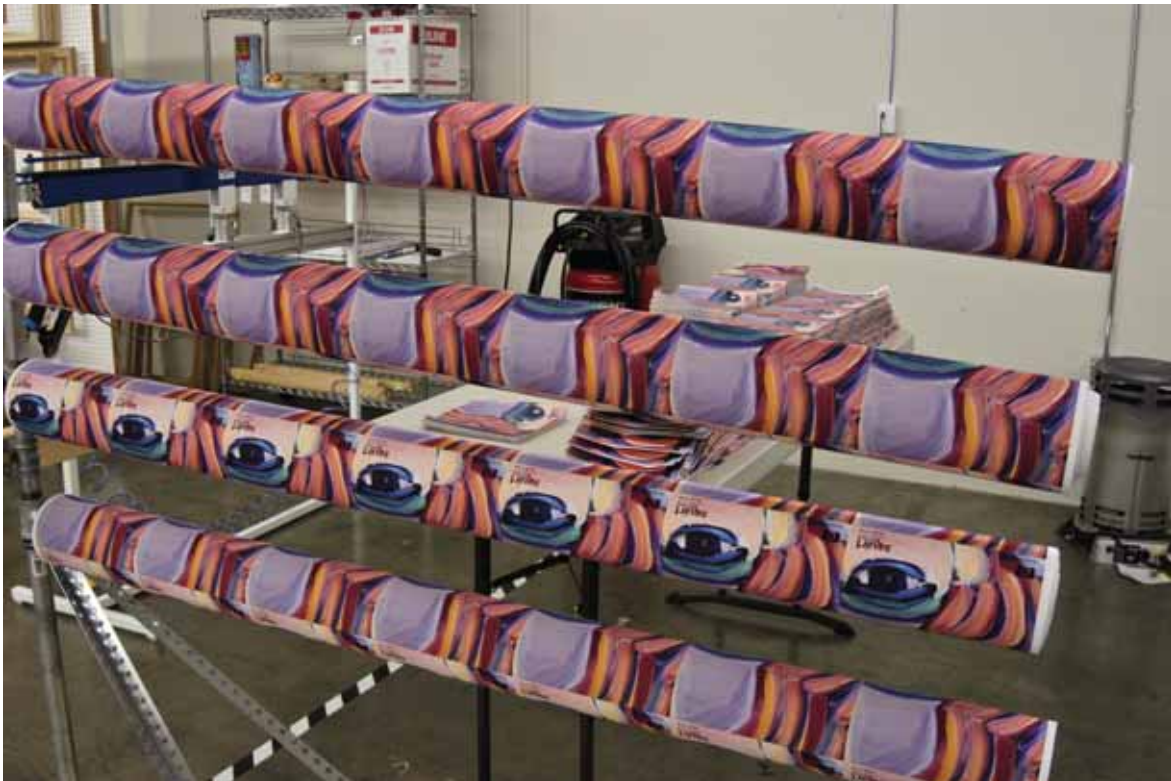
Samples of what will be used in tear-out samples for an issue of Art Business News.