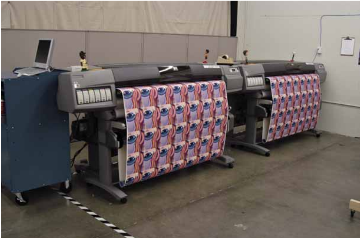
When you have five printers, it is important that your RIP can run everything from a single print server.