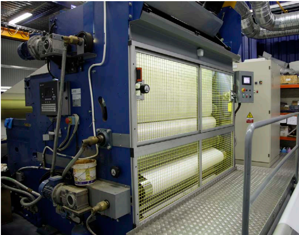
General view of DECAL applying self-adhesive backing on fabric.