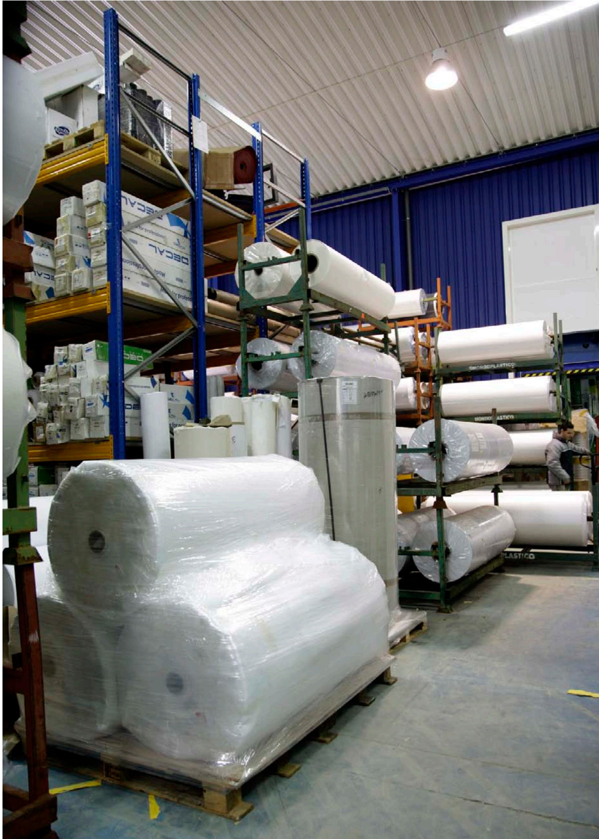
DECAL media rolls ready for distribution.