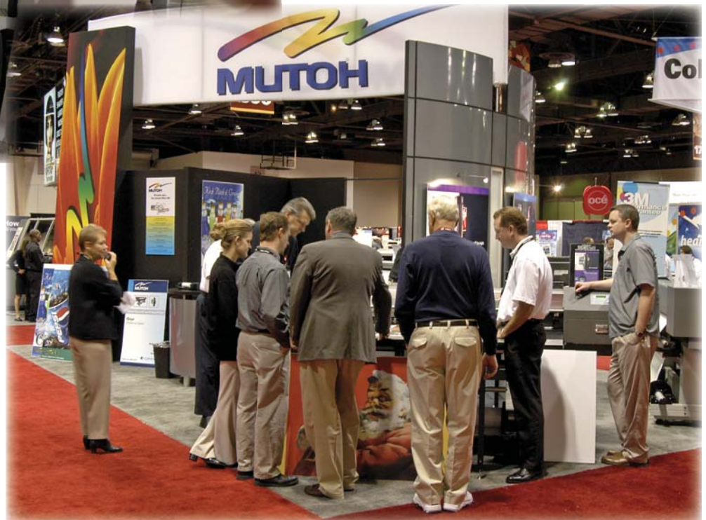
The Mutoh Toucan LT Board Printer at SGIA 2005. This printer handles door mats much like the Zimmer ChromoJet MP.