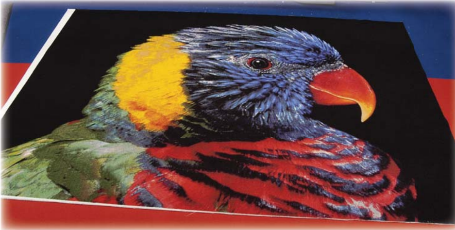
Various mats printed on by the Zimmer machine

The photos available to us from the inkjet printer trade shows cover only the products that they exhibited there, which is only a fraction of the products that Zimmer printers are capable of handling.