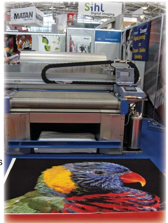
The ChromoJet MP from Zimmer at Fespa 2005

Zimmer is a company dedicated to building machines for printing on mats and carpets. This particular machine is the ChromoJet MP, and is made specifically to print on individual floor mats. Actually some of the results look nice enough to hang on the wall.