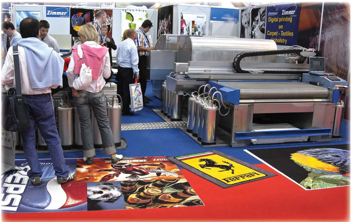
The Zimmer booth at Fespa 2005