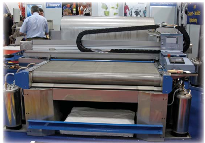
The Zimmer ChromoJet MP