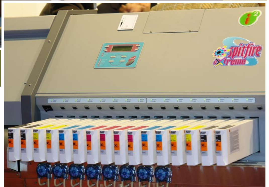
The Spitfire uses the i 2 Intelligent Interweaving print technology, interweaving print technology, that helps you avoid banding issues and select the most suitable print mode.