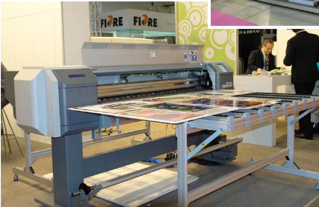
Mutoh hybrid ValueJet 1608HA-64 at Mutoh booth.