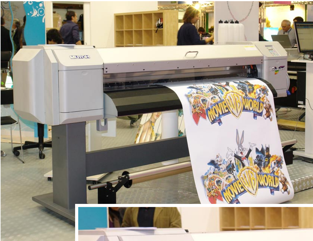
Mutoh ValueJet 1614 at Mutoh booth.