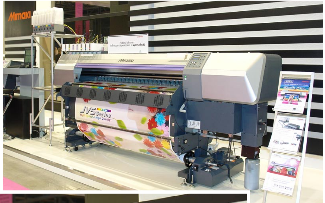
Mimaki JV5-160 solvent printer, at Bompan booth.