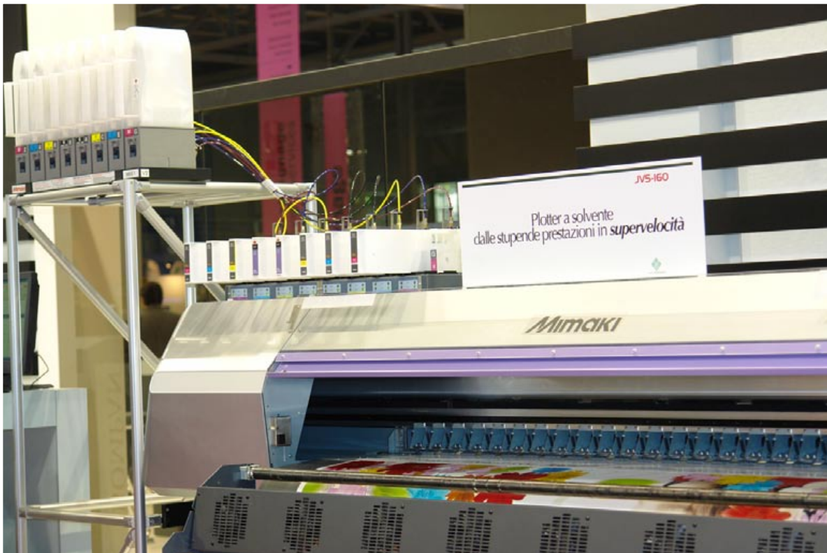
The Mimaki JV5-160 series has an optional postheater to improve the drying speed. Here you see the ink containers of the Mimaki.