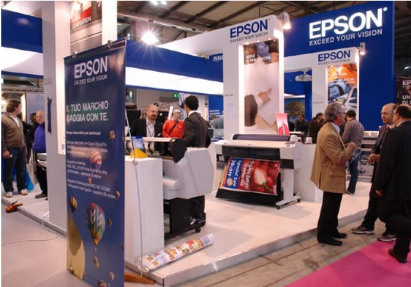
Epson booth at Viscom Italy '09.