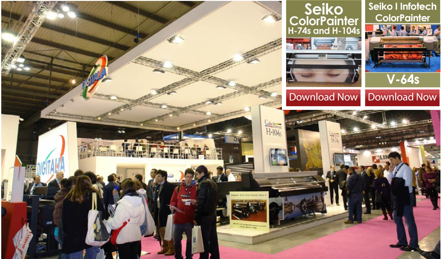
All the Seiko printers were exhibited at the Digitalia booth.