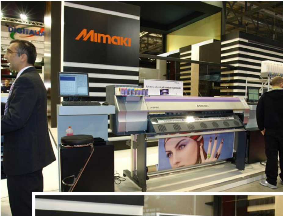
Mimaki JV33-160 solvent printer, at Bompan booth.