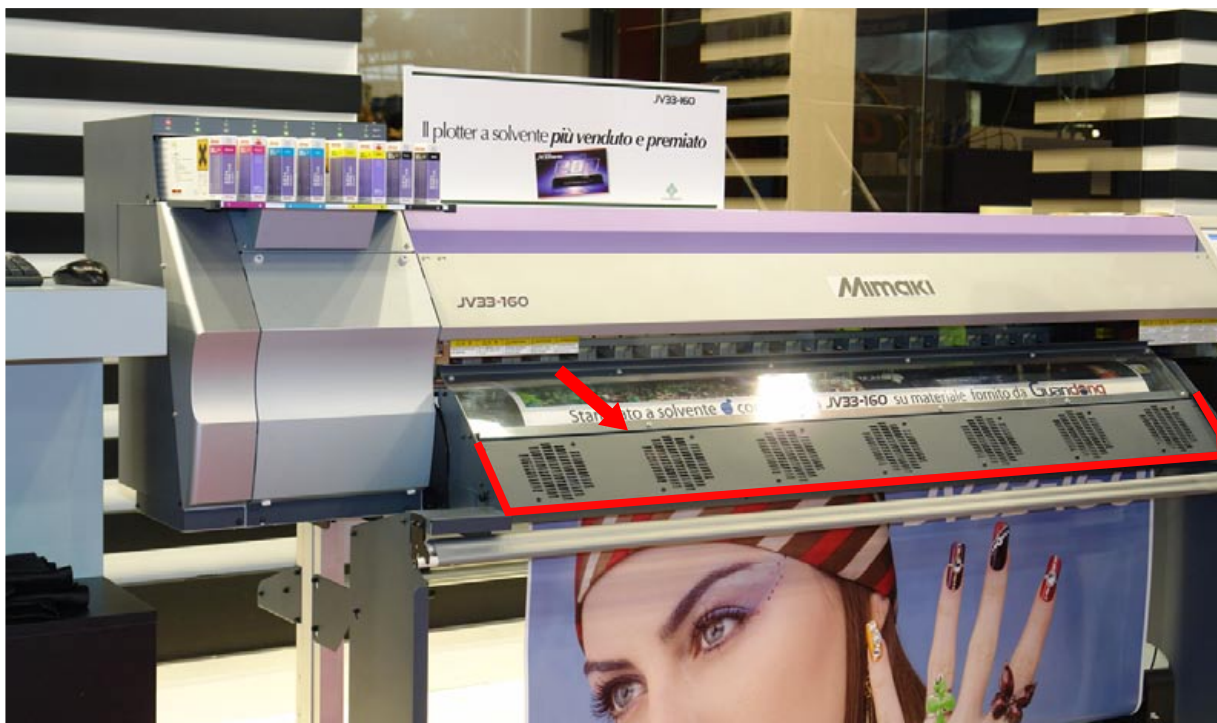
The Mimaki JV33 series has an optional postheater to improve the drying speed