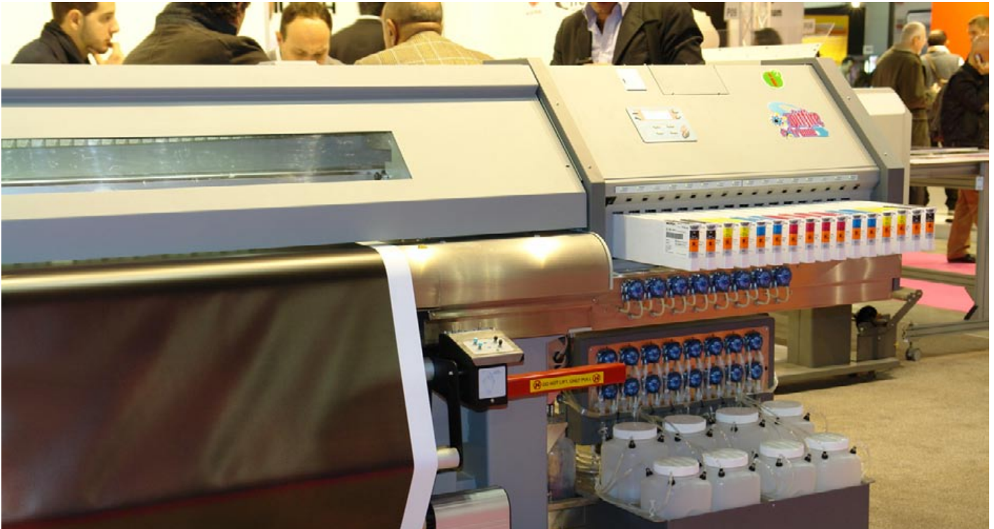
The Mutoh Spitfire has 16 printheads (4 for each color) and uses mild solvent ink.