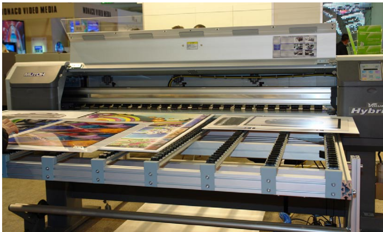
Mutoh ValueJet 1608HA printing some samples at Mutoh booth.