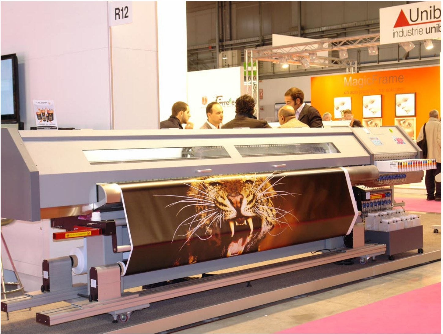
Mutoh Spitfire 100 front view, at Mutoh booth.