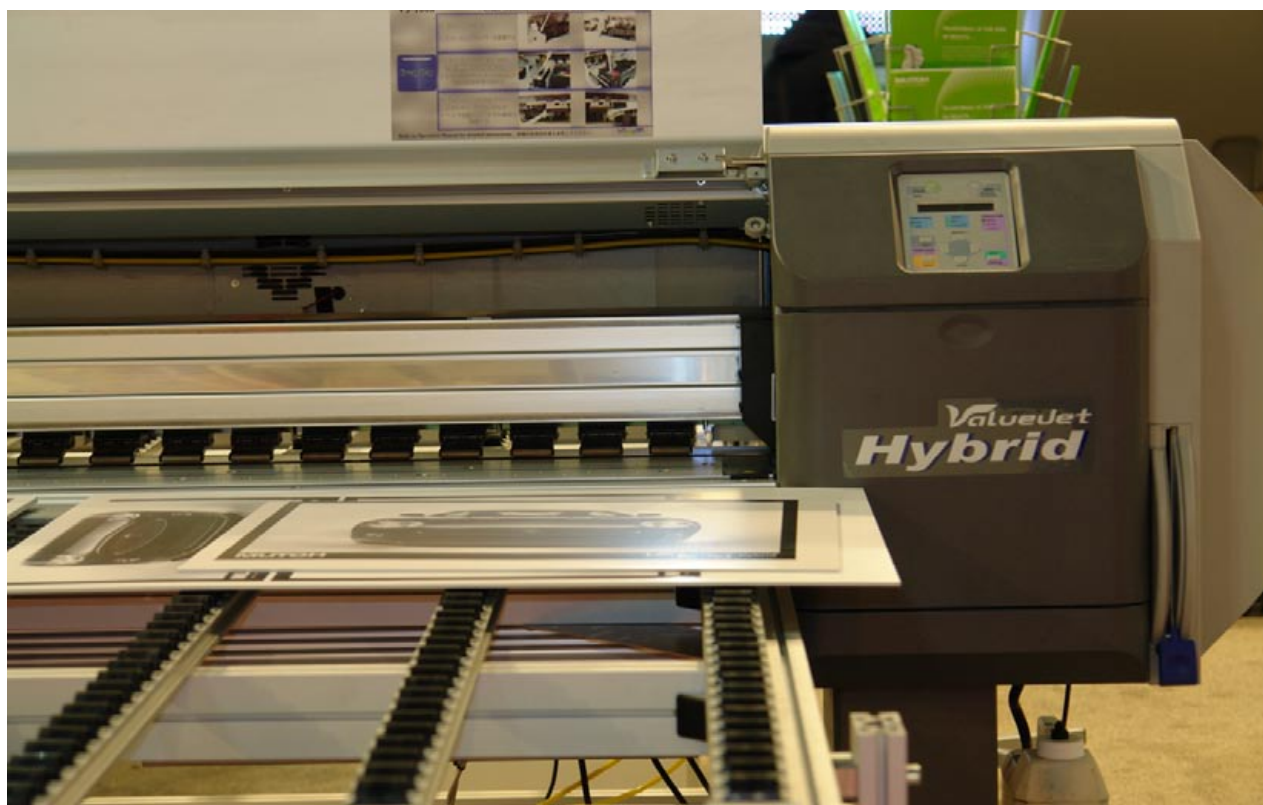
Mutoh ValueJet 1608HA take-up table close view.