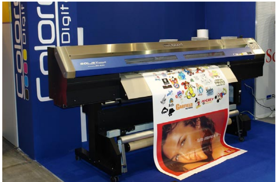
Roland Soljet Pro III XC-540 front view, at Colorcopy booth.