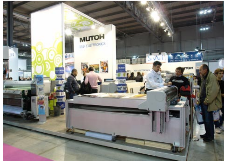
Mutoh booth at Viscom Italy '09.

Several modified Mutoh printers were in other booths (on hand-made flatbed platforms).