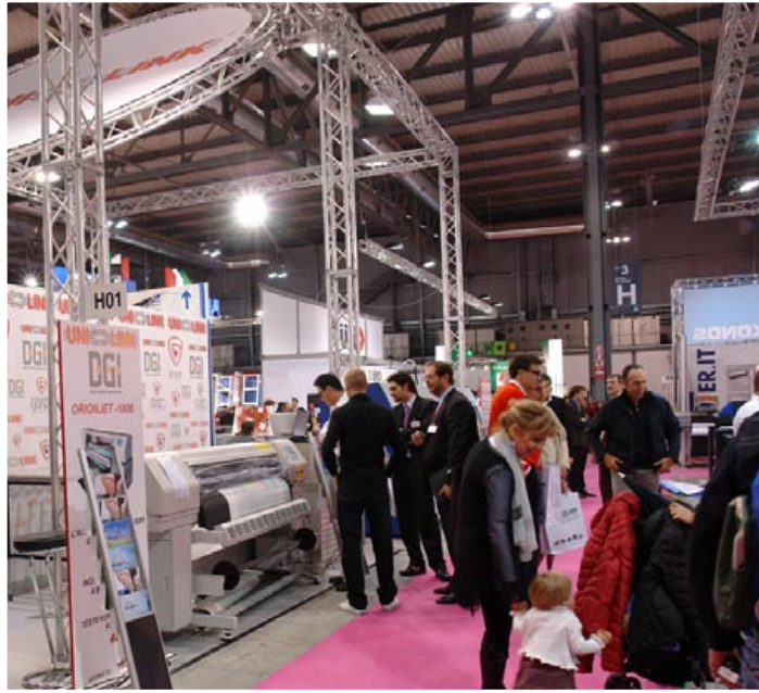
The D.G.I. printers were exhibited at the UniLink booth.