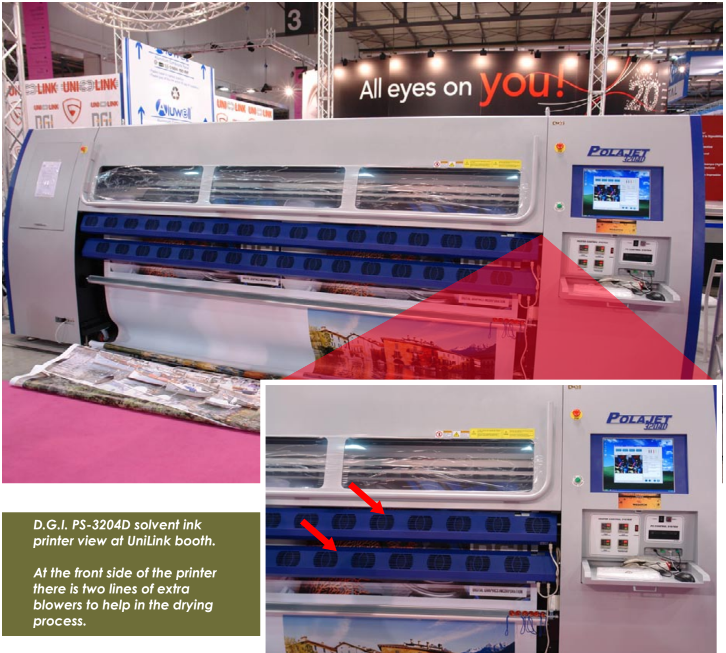
D.G.I. PS-3204D solvent ink printer view at UniLink booth.

At the front side of the printer there is two lines of extra blowers to help in the drying process.