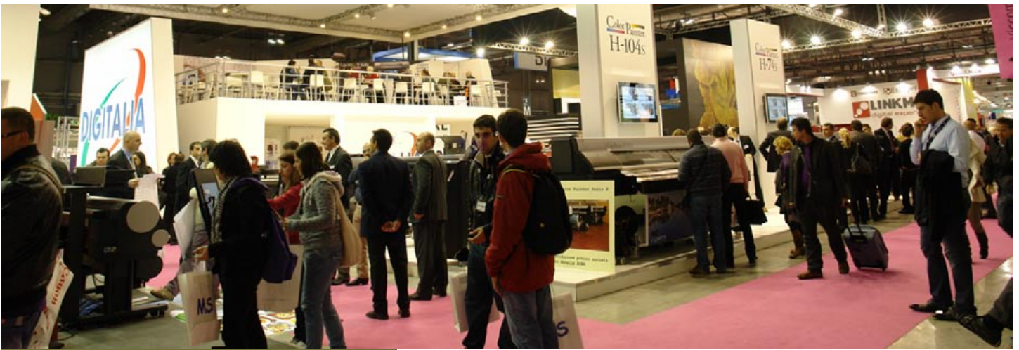
Viscom Italy '09 hall view.