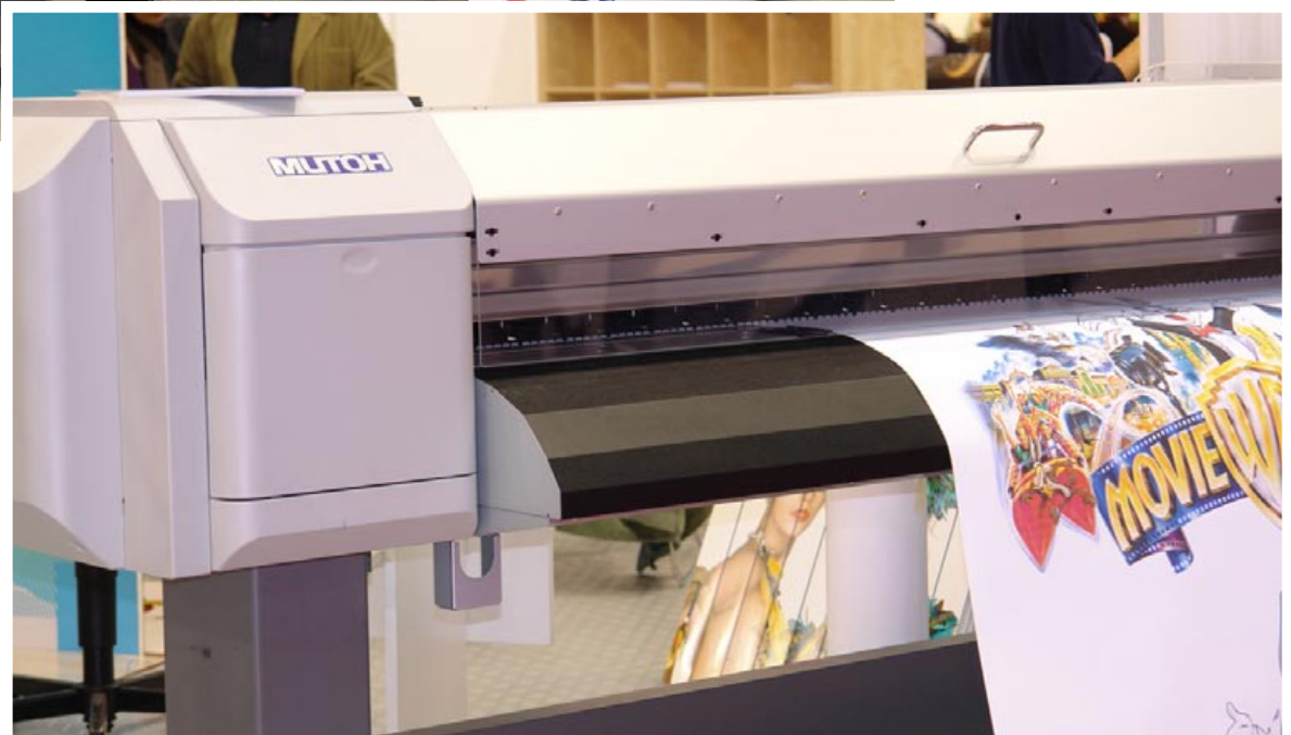
The Mutoh ValueJet 1614 has an individually controlled pre, platen and post heaters