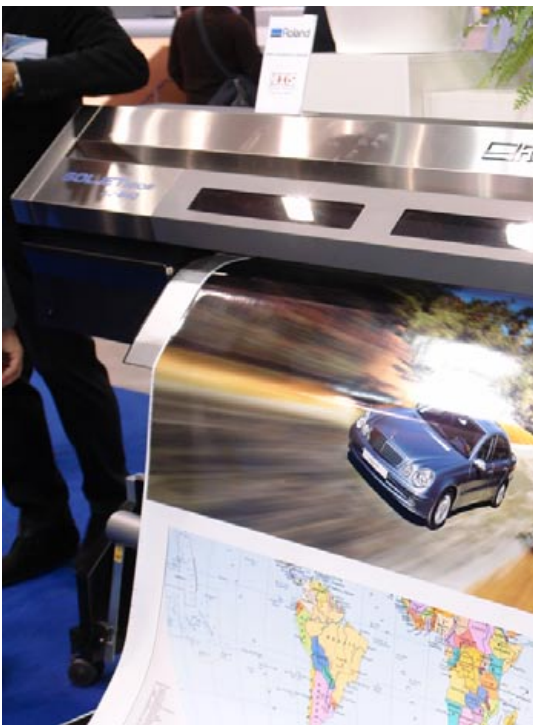
The Roland Soljet Pro III has an individually controlled pre, platen and post heaters