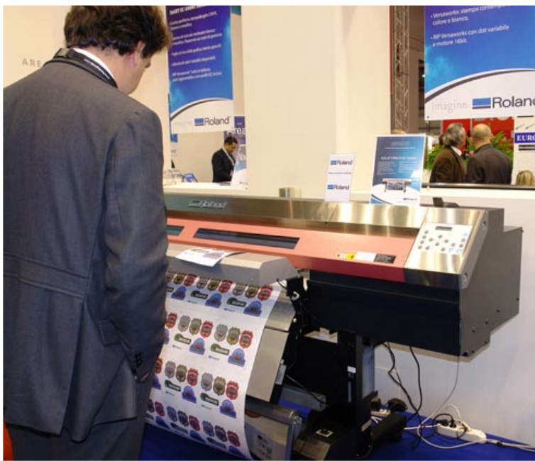
Roland Soljet Pro III XC-540MT view, at Colorcopy booth.