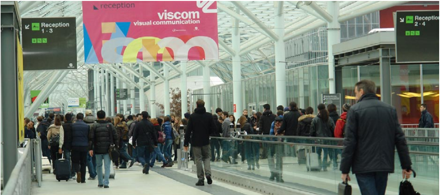
Viscom Italy '09 main entrance.