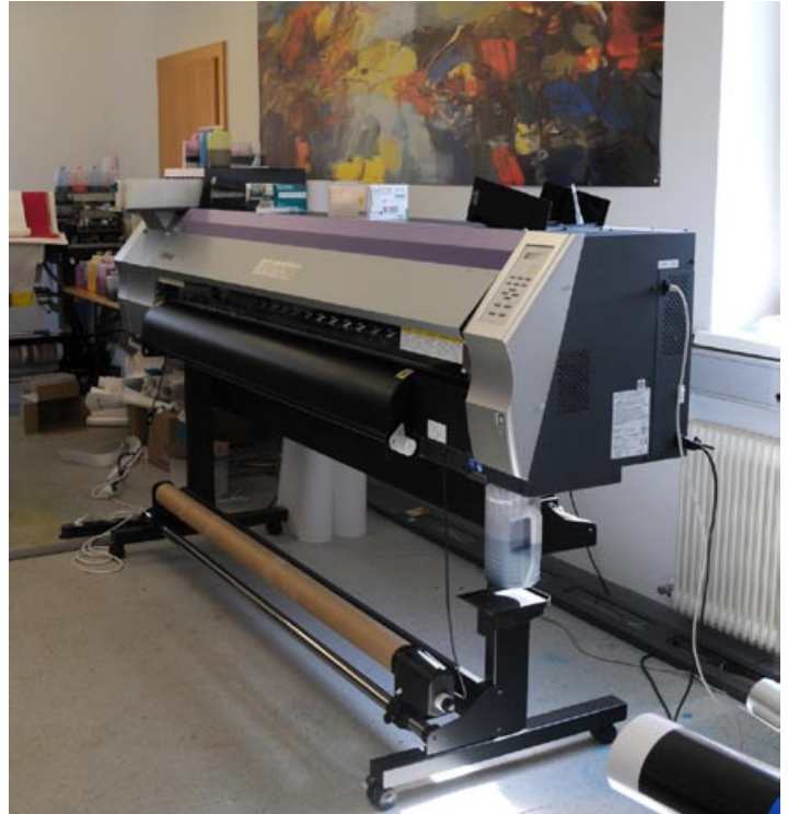
Mimaki solvent printer. The initial stage of the implementation of the ink is being done in solvent printers chassis.

But I also predict that whichever Japanese companies come out this year, by SGIA in the autumn, with a "concept car" Sepiix printer and have this machine in beta stage by ISA 2011, this Japanese brand will take over market share from all other inks: eco-solvent, full-solvent, latex, and UV. It would also be interesting if, for the first time, that Chinese manufacturers offer a "first," namely a printer made from the ground up to handle Sepiix ink. This is a golden window of opportunity for Chinese printers to outsell Roland, etc. In the past Chinese have waited, and then copied. Today, in 2010, they can make history.