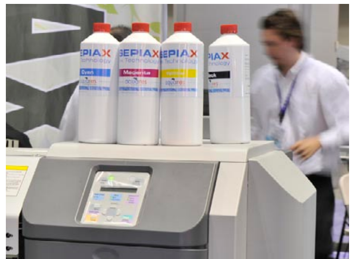
Ink comes in 2-liter bottles

Do if the results are not what you expected, it may be the printer, or the workplace conditions (an air-conditioning unit on one side of the room that affects one portion of the print path). In other words, competitors will delight in blaming the ink for iffy results. But when the printers are correctly outfitted and operated under appropriate conditions, the ink may be considered as having turned into a wonder product.