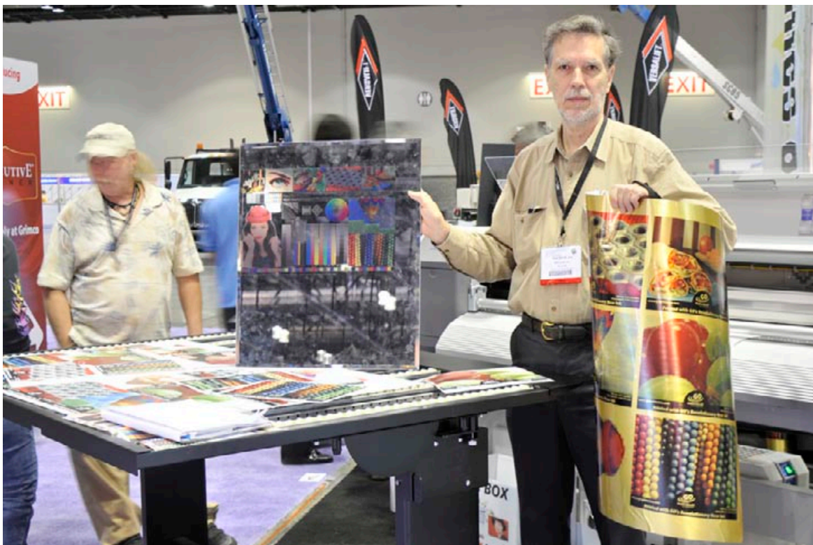
Sepiix print samples at ISA 2010

With Sepiix ink no primer is needed on most materials (glass would be the only possible exception). If media is coated, naturally most inks work better: more color saturation and detail in some cases. But the point is that most of the samples in the Sepiix booth are raw uncoated substrates.