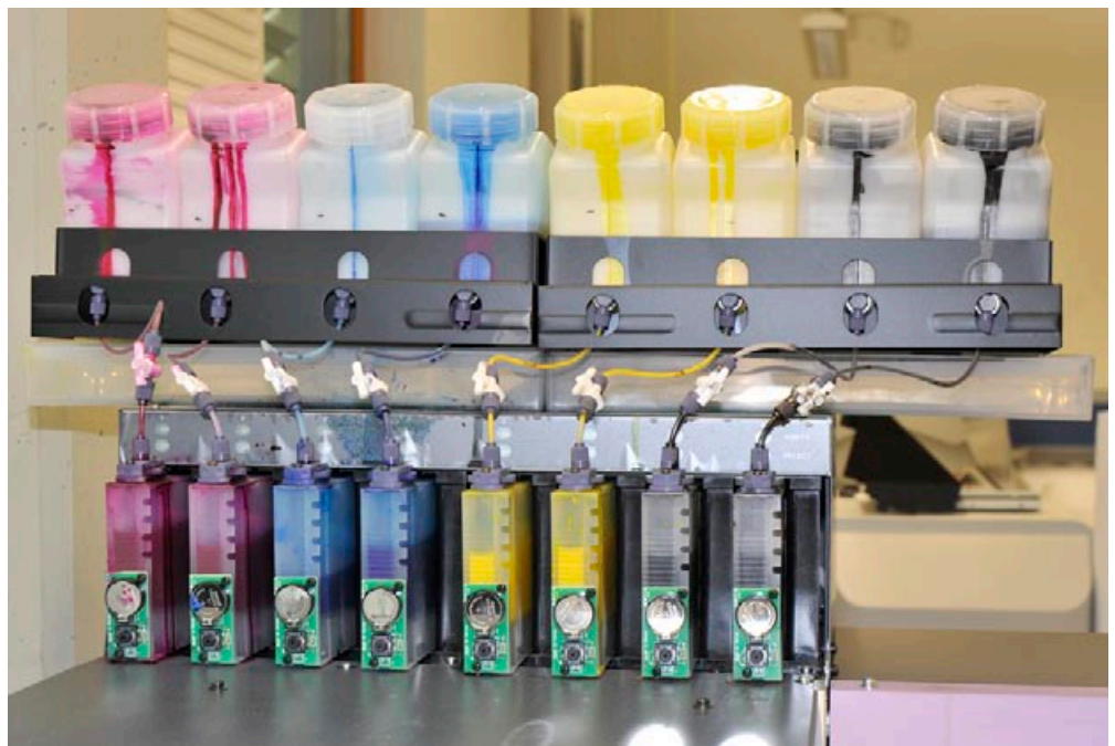
Sepiax inks being tested with a Mimaki printer.

So yes, with resin inks we are entering new territory. I am excited by the potential precisely because all the other innovative new inks did indeed fail. They either were inadequate chemistry or inadequate corporate understanding of how to bring a really unusual ink into the close knit wide-format printer world. I feel that Sepiax ink is the first ink since UV that is likely to become a phenomenon.