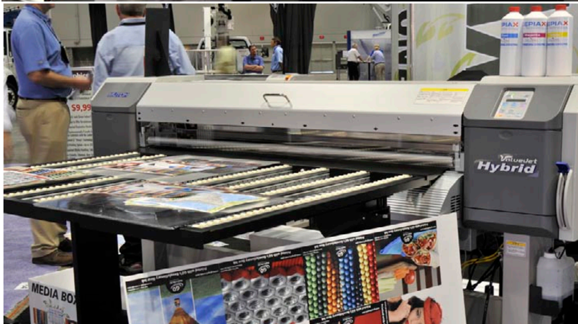
This is one of the Mutoh printers at Graphics One modified to print with SepiaX ink.