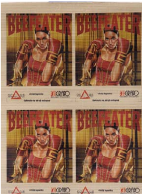
Corrugated brown board.