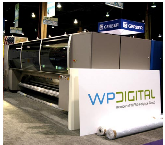
WP Digital Virtu RS35 at ISA 09.

If you are about to spend umpteen thousand dollars on a UV printer, FLAAR has several additional publications to assist you. This report is only on pricing aspects; there are even more crucial questions on the differences between a hybrid, a combo, a dual-structure UV printer.