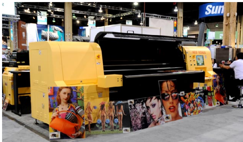
Dilli Neo Venus at ISA 09.