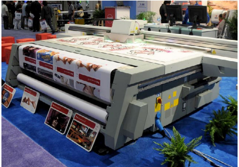
Oce Arizona 250 flatbed printer GT at ISA 08.

That was the Oce Arizona 60uv; it was withdrawn after even Oce realized it would not function adequately. Today, the Oce Arizona 250 GT and related models at $120,000 to $140,000, are literally the best-selling UV printers in the world, with over 900 units sold (so more than even ColorSpan 72uv series). In other words, a mid-range UV printer at a price which allows the manufacturer to utilize adequate components has more chance of providing reliable production in a sign shop.