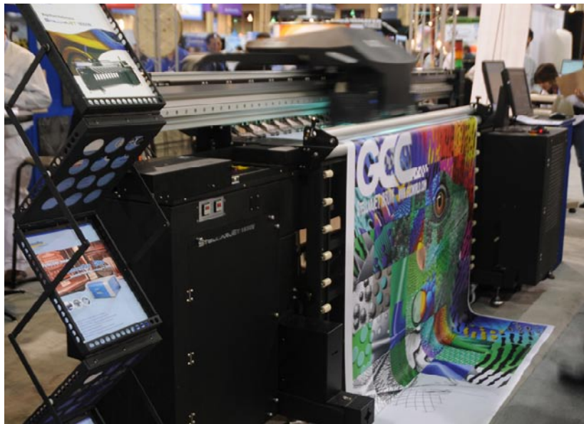
GCC StellarJet 183uv at ISA 09.

We ourselves have no way to calculate resale value, but we would estimate that the highest resale value will be for a printer whose company will not be sold in 2009-2010, whose distributors will not drop this brand: this is a known brand name; they have tech support worldwide; they carry spare parts for all past machines. GRAPO, GCC, Dilli, Durst, WP Digital and other companies have a good record. The economic recession has hit a few other companies hard, and their tech support could possibly suffer as a result. So if you are thinking about a brand for your short list, be sure to ask other people who already own that brand.