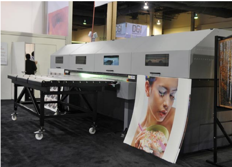
Durst Rho 800 at ISA 09.