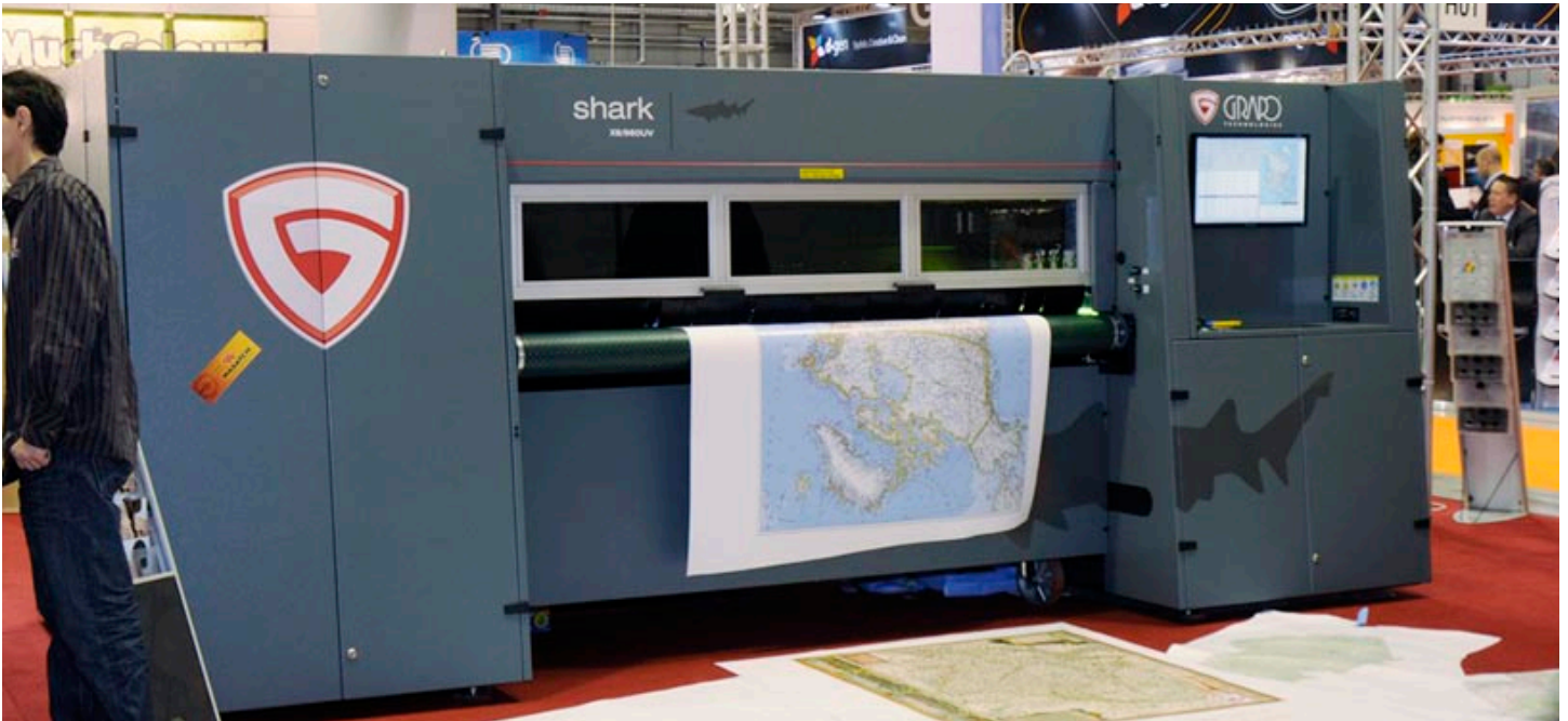
Grapo Shark at Viscom Italy 08.