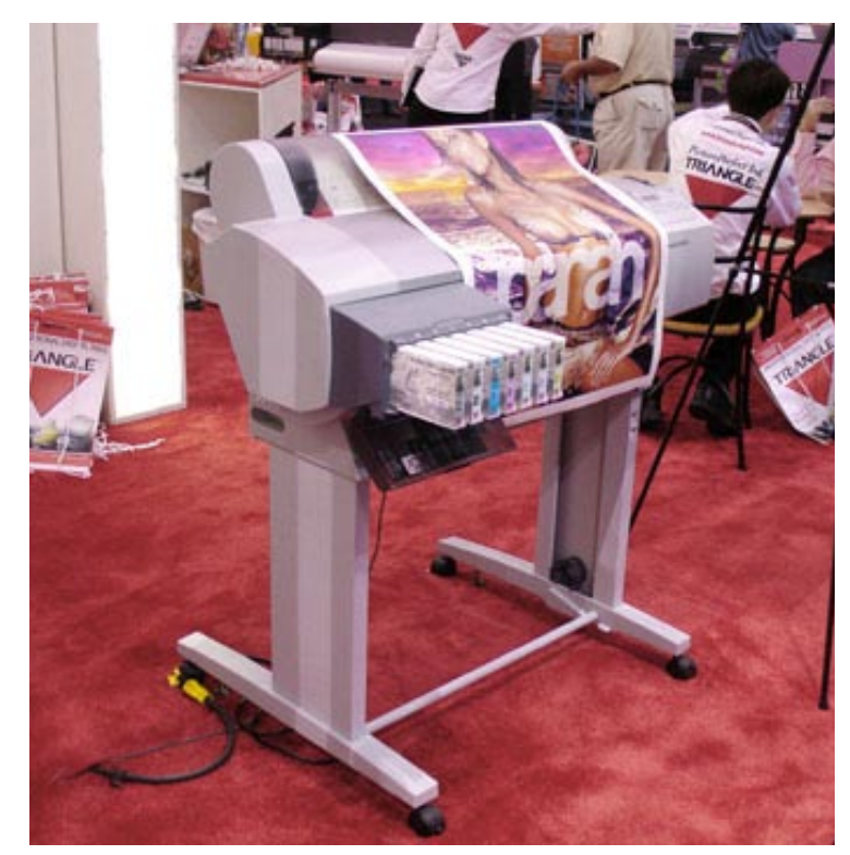
Epson Stylus 7600 at Print 05

Because Epson was overwhelmed by Canon and HP during 2006, Epson is the most likely to produce new and better printers during 2007. Their Epson 3800 was only a barely perceptible improvement. They will have to do better than this to win back serious professional production shops. But Epson will continue to do okay with individual photographers, individual artists, and people who are content with Epson the way they are now. The current Epson models are not bad (other than guzzling ink); they are simply no longer the cutting edge. Canon and HP are far ahead in innovative technology.