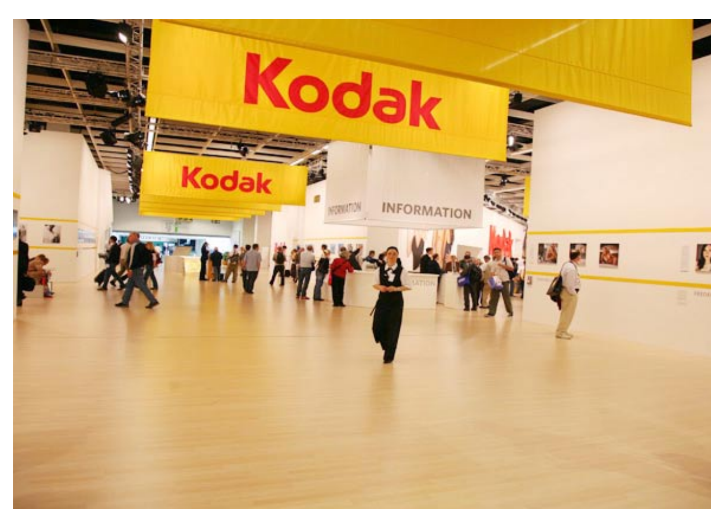
Kodak empty area, Photokina trade show, 2006

But new wide format printer technology is good for everyone, so we hope that indeed there is a new wideformat inkjet printer from Kodak. Our reviews of the Encad printers were proven correct; our review of the