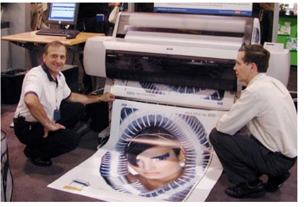
Epson StylusPro 10000 at Seybold 01