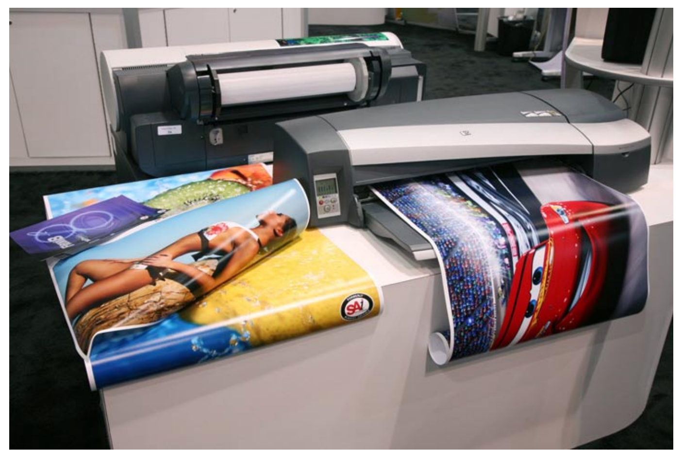
HP Designjet 130 at Sign Madrid 06

For 2007 the first hints of MEMS technology and page array alignment of heads will be talked about even more than it is now.