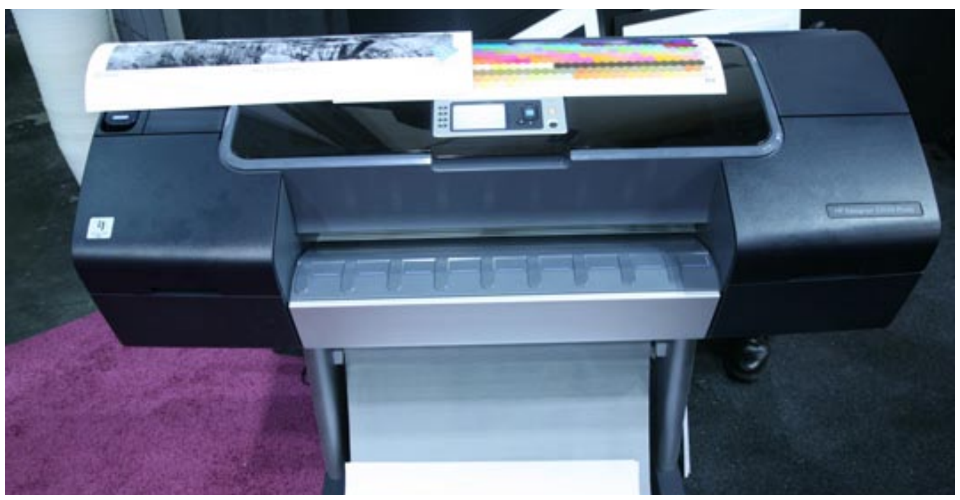
HP Z3100 at PhotoPlus 06

Since there are 8-channel and 12-channel 24" and 44" HP Z-series printers, and since Canon already has a 12-channel 60" printer, HP will continue to lose sales to Canon until they too offer a 12-channel 60" machine. Since the 8-channel models came out first, that is the most likely printer to expect at PMA: an 8-channel 60" printer.