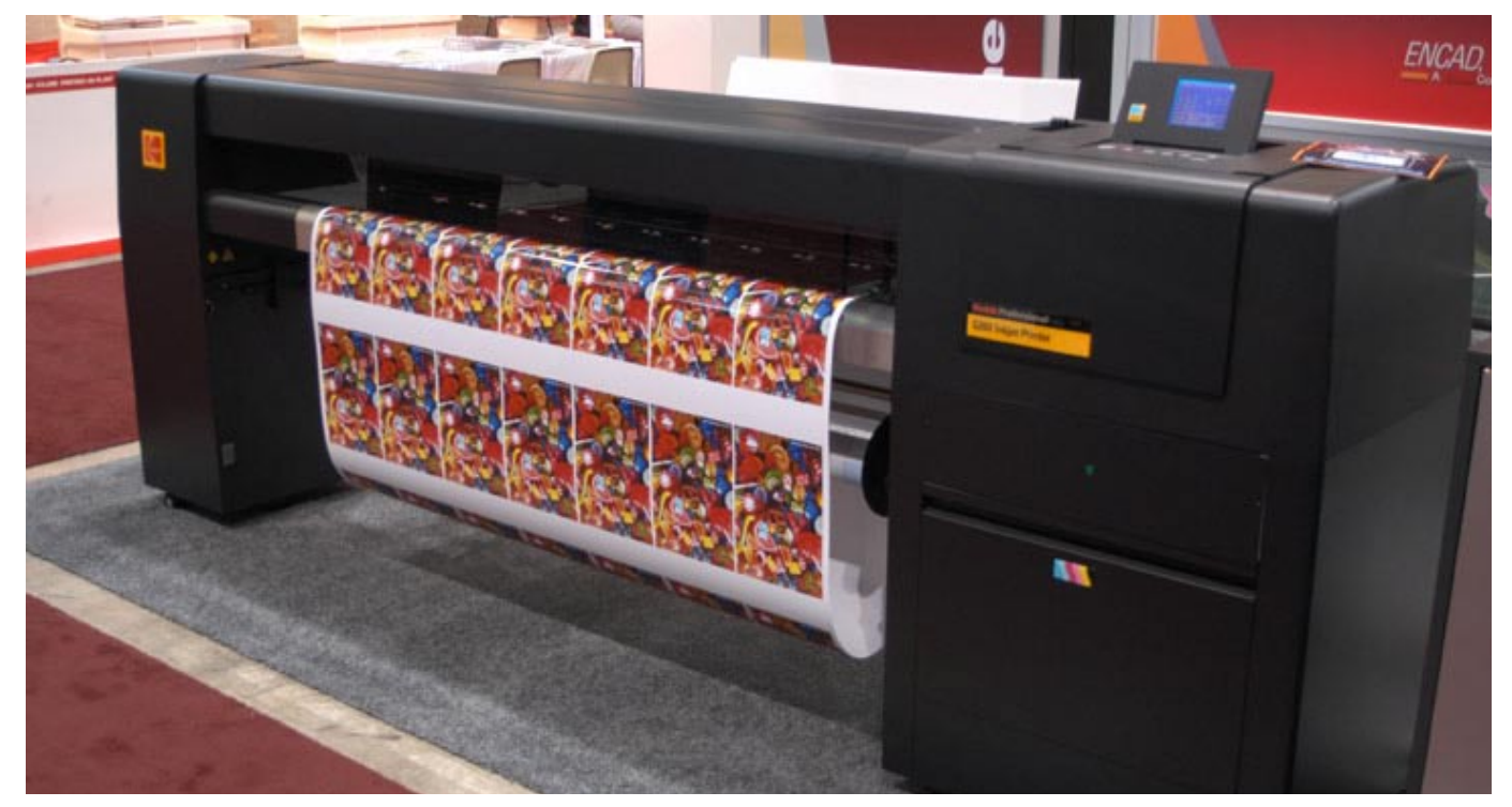
Kodak 5260 printer at GraphExpo 02

If this printer has a page array (an array of printheads the width of the entire page), and if it has no banding, then it has a slight chance. But a page array, unless there is a back-up array too, has trouble correcting for one nozzle being out, because a single page array can't do back-and-forth interweaving to overwrite the bad nozzles.