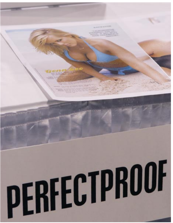
Print from the Epson 4000 at PerfectProof booth GoA 04

The rumor for years is that Epson will produce a printer wider than their usual 44". Epson is trying to go after the HP market which has the 60" HP 5500. Until now Epson used Roland, Mutoh, and Mimaki to go after the signage market (because Epson printers were too slow). But if Epson can speed up their piezo printheads, they can attempt to go after the sign maket in 2007. The problem with a 60" Epson printer is that it will run head on into the new 60" Canon iPF9000