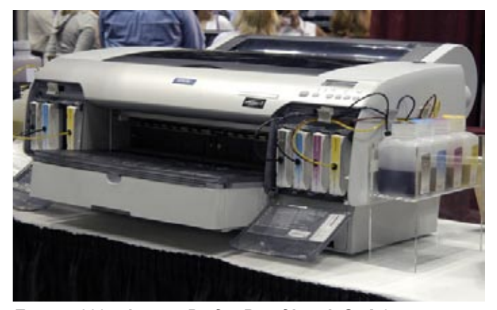
Epson 4000 printer at PerfectProof booth GoA 04

Yet the Epson R800 is the product to really watch. As soon as this appears in wide-format size (wider than the R2400), Epson can get back some of its lost market share. Epson does its homework, listens to what people ask for, and then develops these features as quickly as possible. Epson is the best example of a company that interacts with its faithful public supporters. It is like the Macintosh phenomenon. People just love their recent model Epson printers.