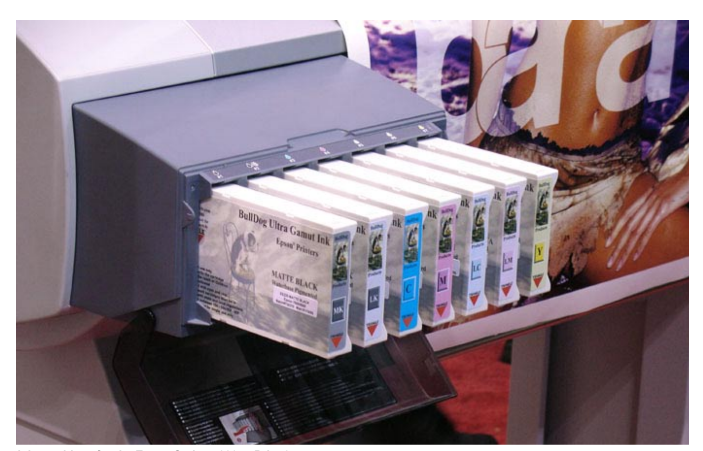
Ink cartridges for the Epson Stylus 7600 at Print 05

But if a laminate can be found that can be jetted from current printheads, it can potentially simultaneously provide gloss optimization (eliminate gloss differential on glossy media) and provide protection (both against light and scratches). Several companies told me at Sign Spain that they are either already working on jettable lamination or are thinking about doing this. So it would be a fair estimate to surmise that the big three manufacturers are also testing this technology.