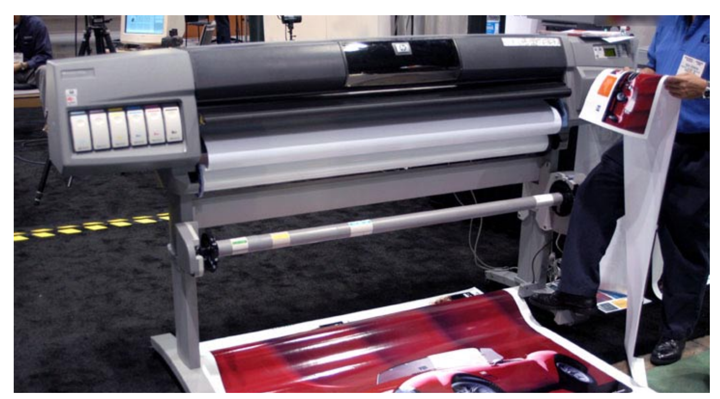
HP 5500 at GraphExpo 02

It is the tradition for printer manufacturers to show their new technology at desktop sizes, and then to release this technology at 24" size and then wider. So the HP B9180 of 2005 ushered in a new era of advances for HP that we can expect will result in eventual replacement for the venerable HP 5500.