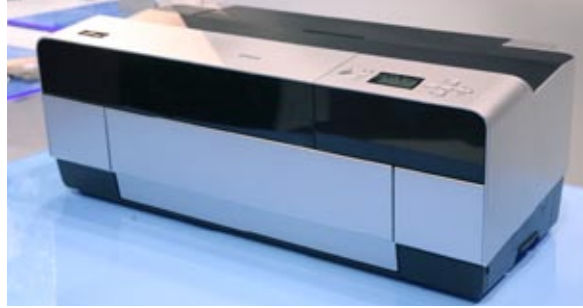
Epson StylusPro 3800 at Sign Madrid 06