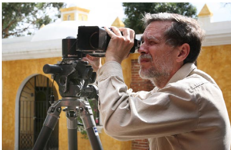
Phase One P25 digital back

Hoodman CF cards. The Compact Flash cards used by FLAAR, in our Nikon D200, Canon EOS 5D, and medium format PhaseOne P25 are all super-fast RAW CF cards from Hoodman USA. You can see Hoodman cards at PMA, at PhotoEast and other photography trade shows, or visit www.HoodmanUSA.com .