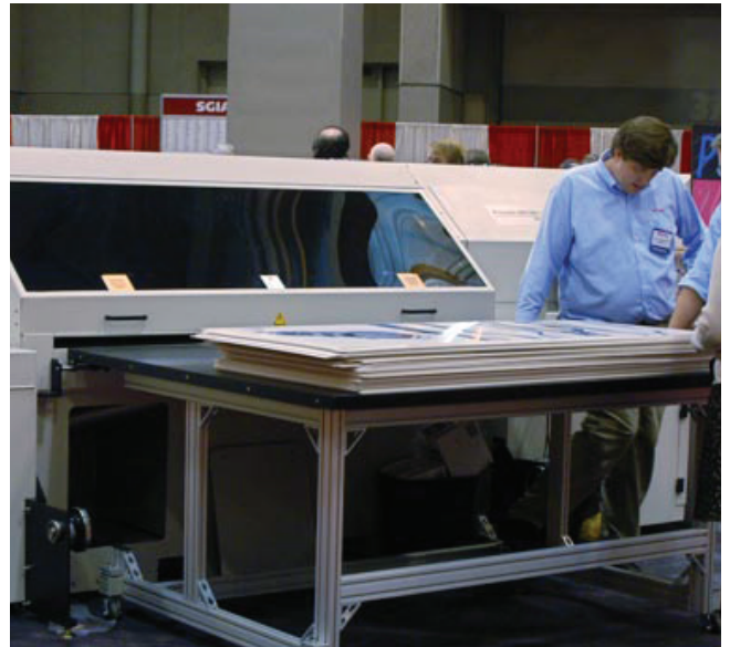
VUTEk PressVu 180 EC at SGIA 2002. Those were the early days of UV technology. The predecessor of this UV printer was a solvent printer.

We have moved these downloads to another part of our immense reference archive. After an initial period based on factory inspection, to update these reports we prefer to have a site-visit case study of an actual end-user using this model of Sepiax Resin Inks.