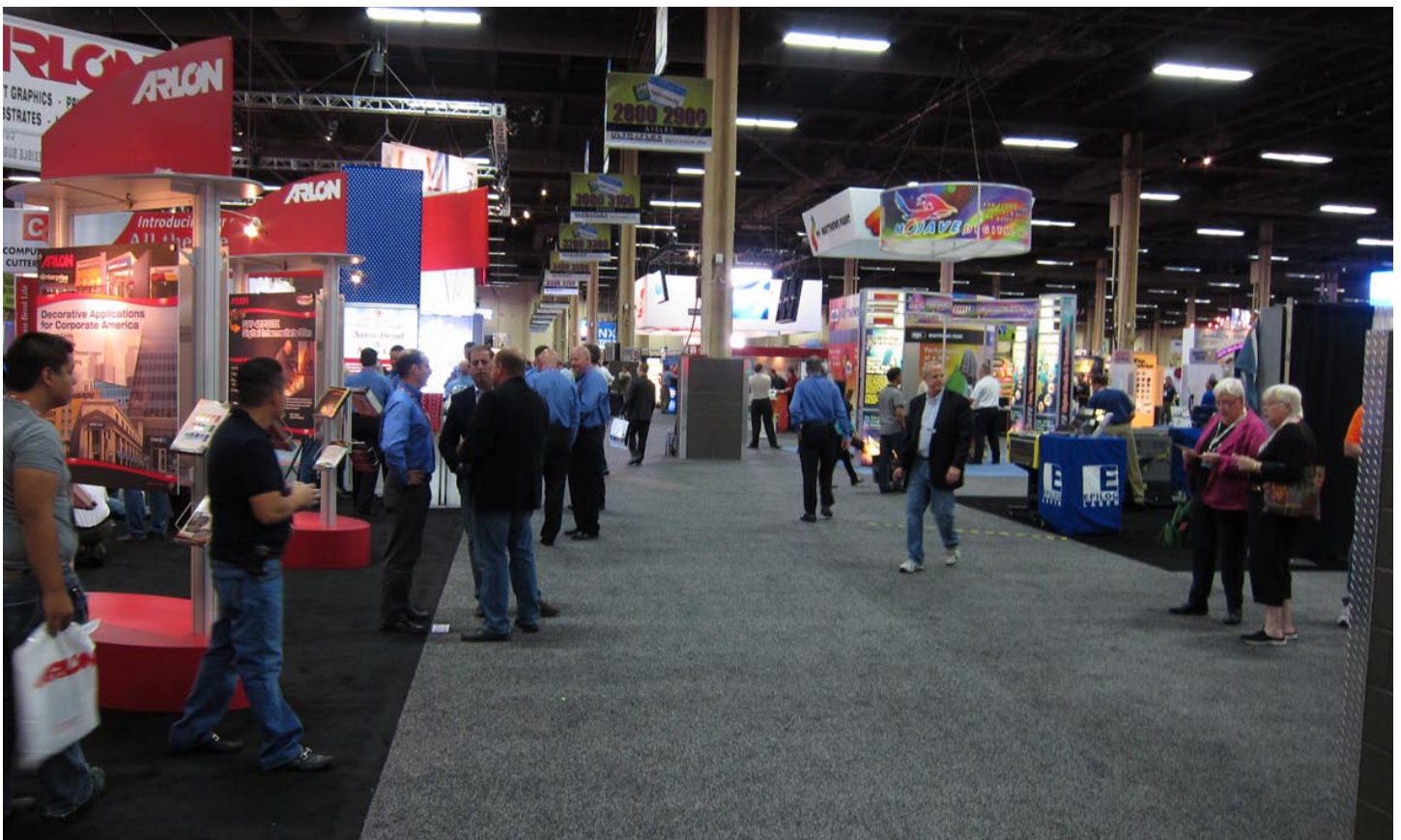
Hall view of ISA 2011 trade show.

Here is a list of the textile printers that exhibited this year at ISA, plus comments, and comparative charts.