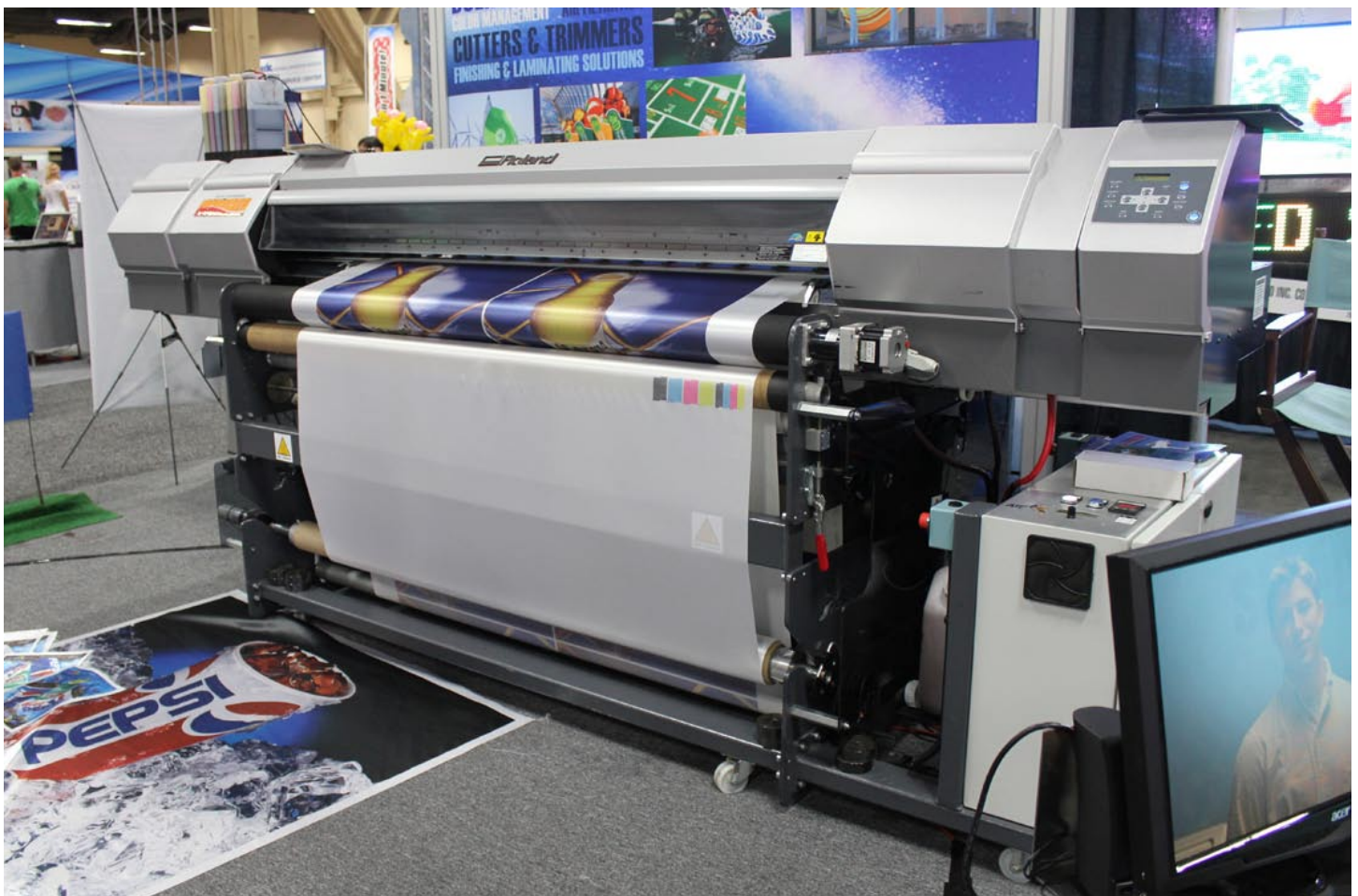
Splash of Color Heatwave DPF-74 printer,