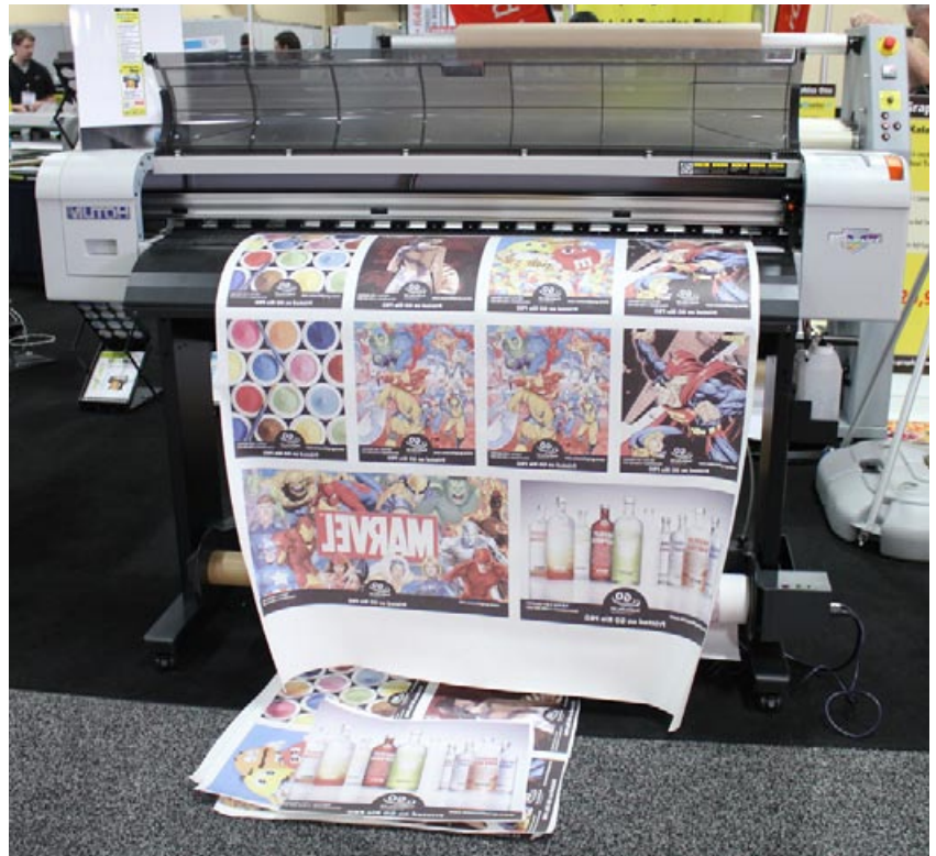
Graphics One RIO Pro 54" printer.

Graphics One is a Mutoh distributor, especially for Latin America. Graphics One also has contacts in China, so can source both printers and fixation units there too.