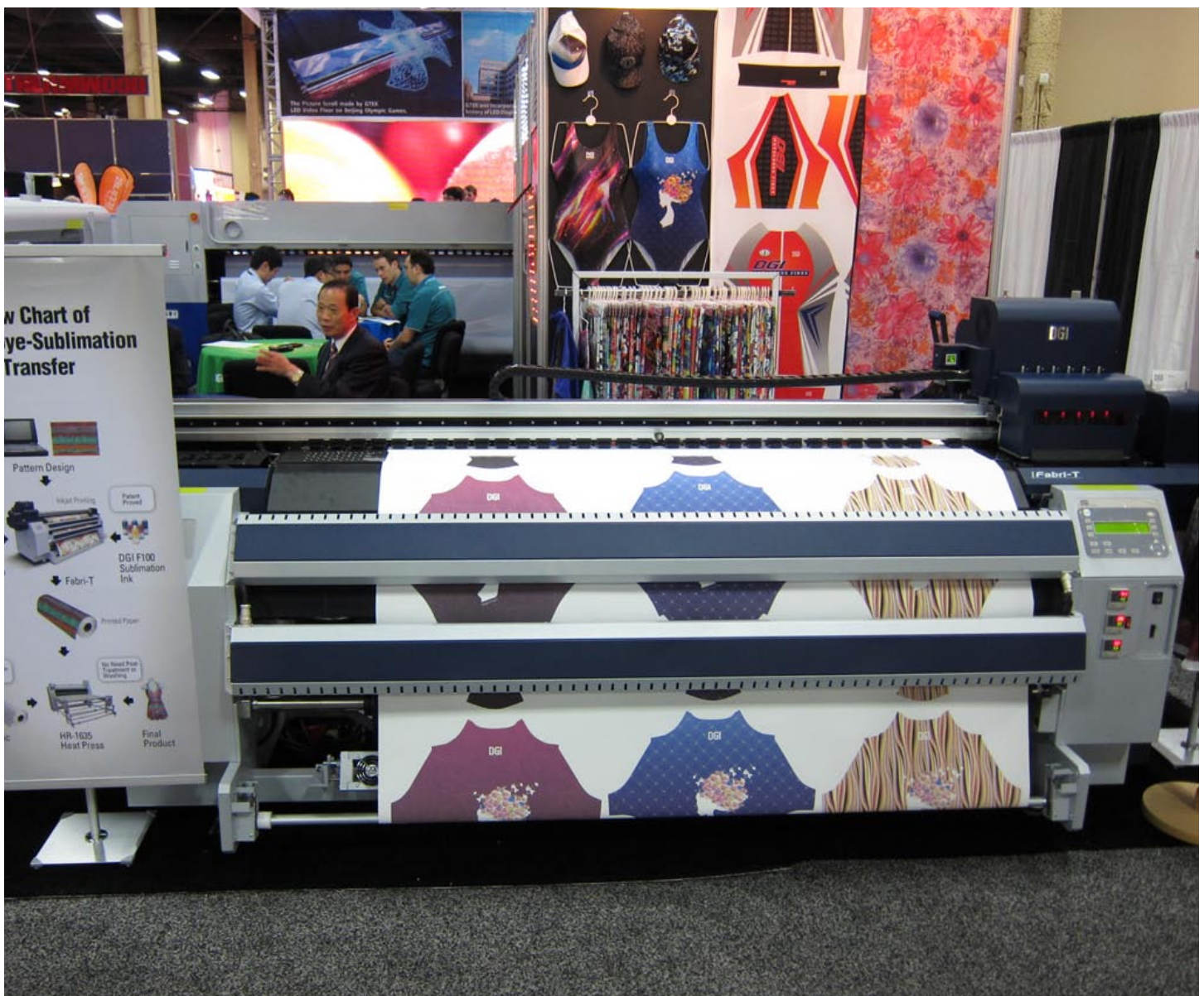
D.G.I. Fabrijet Fabri-T (1806) printer.

Fabri-T is a dye sublimation paper transfer printer with an integrated heating unit system.