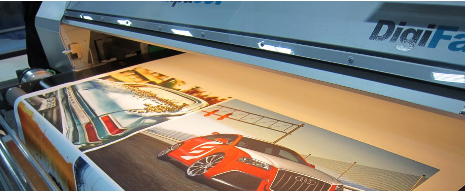
Photo on cover: DigiFab StampaJet I-64 print close-up at ISA 2011.