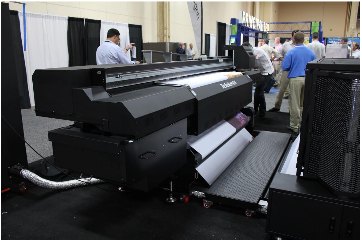
d-gen Teleios GT textile printer.