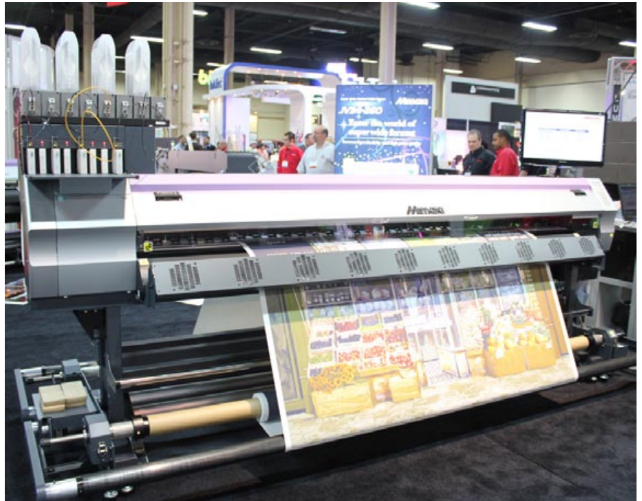
Mimaki JV34-260 printer.

Mimaki JV34-260 can be used with both dye sublimation for transfer paper for polyester blends, or water-based solvent inks.