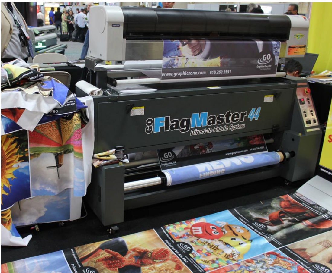
Graphics One Flagmaster 44" printer.