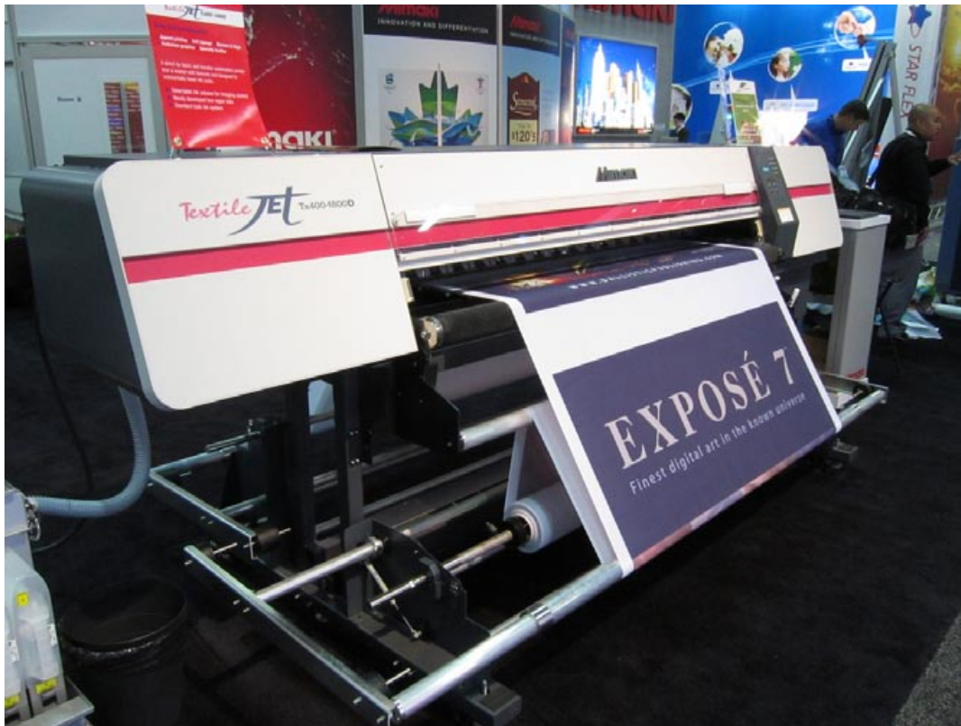
Mimaki TextileJet Tx-400 printer.

Of the four Japanese solvent printer manufacturers, Mimaki has the most experience making printers for textiles. This by itself is not automatically a guarantee that their printers are inherently flawless, but Mimaki does have a long-range and long-term commitment to textile printing.