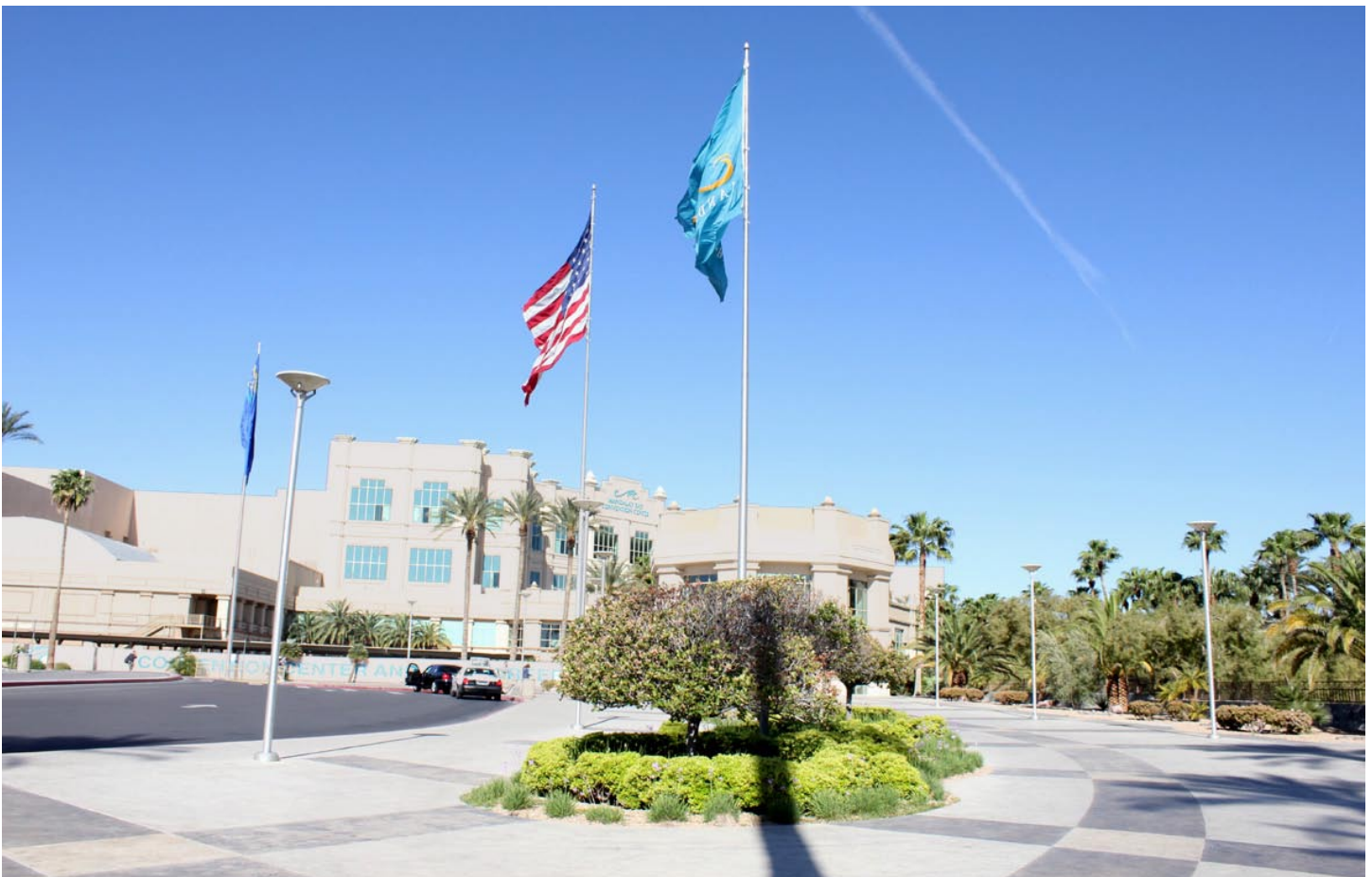
Mandalay Convention Center.

The ISA 2011 Sign Expo banners and signage were visible once you entered the convention center, but walking to the convention center no signage was available to the visitors looking for this trade show or the other convention on medical supplies which was also held at this venue.