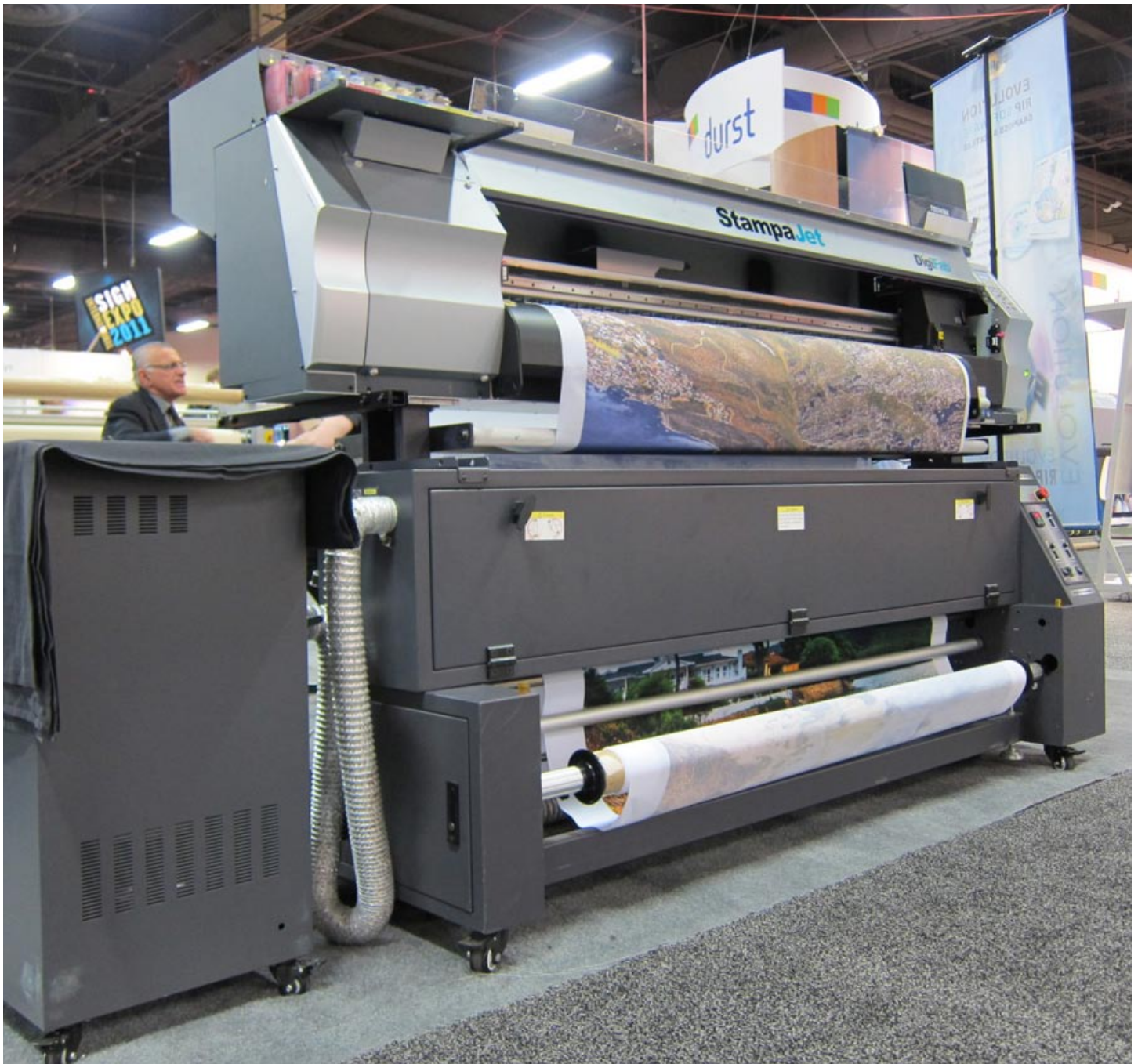
DigiFab StampaJet BP-64 textile printer.

DigiFab offers several advantages: first, they have years and years and years of experience in the textile market. Second, DigiFab is 100% dedicated to the textile market.