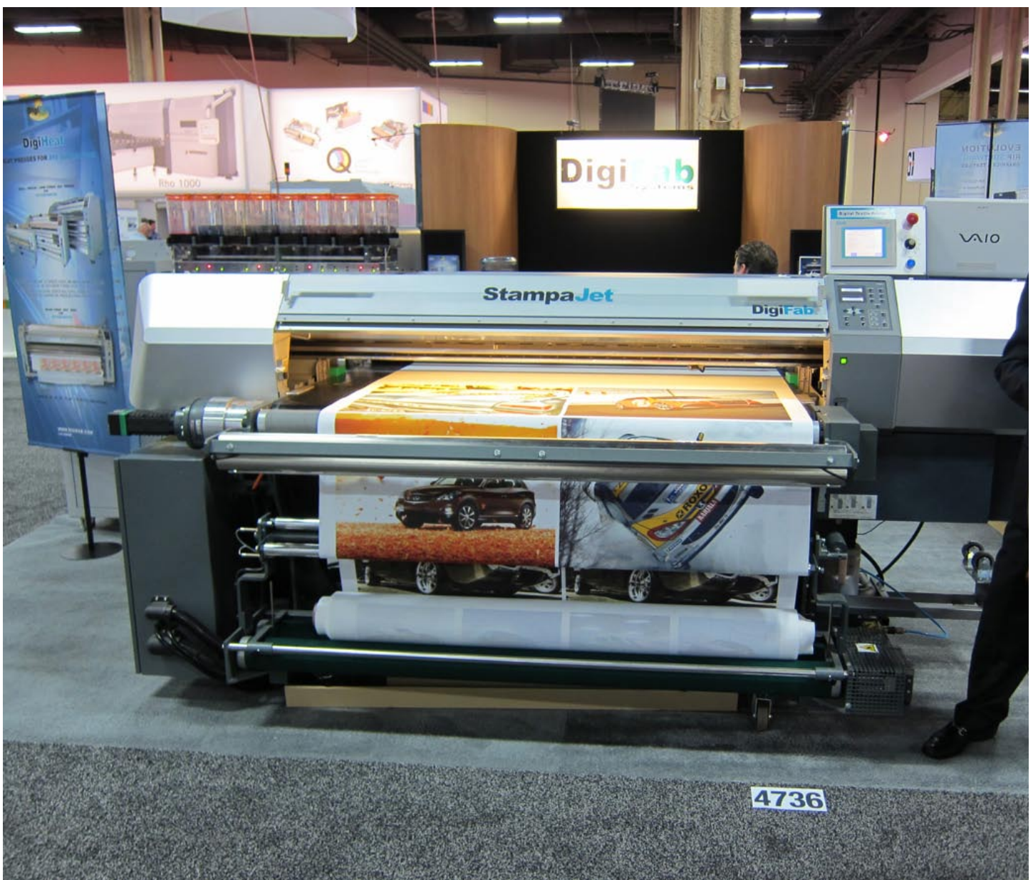
DigiFab StampaJet I-64 textile printer.

The most notable difference between these printers is in the ink feeding system, the StampaJet BP-64 has ink cartridges while the StampaJet I-64 has ink tanks. The other visible difference is the adhesive belt transport system on the StampaJet I-64.