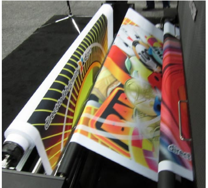
d-gen Teleios GT take-up roll.

Since ISA 2011 was held at Las Vegas, d-gen was printing some casino themed images onto flag material. The images had very nice colors even before they passed through the heater, obviously when they came out of the heater you could see the already brightly printed colors pop and come alive.