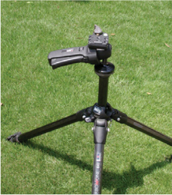
Grip Action Ball Head 322RC2