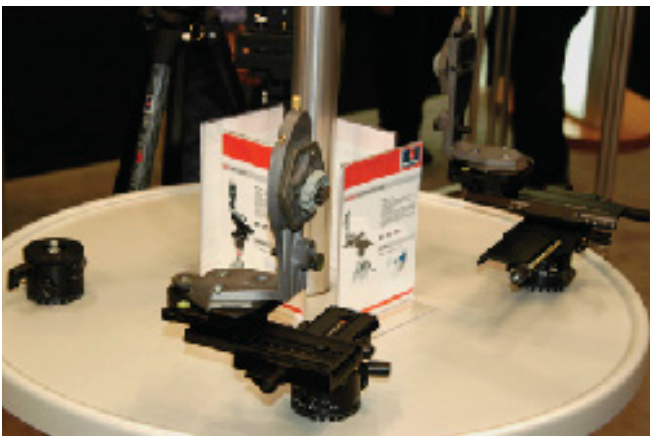
Bogen Manfrotto QTVR Head