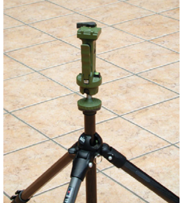
Green Grip Action Ball Head with Quick Release Plate 3265G