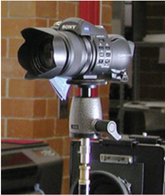
Samples of Gitzo Tripod Head G1177M