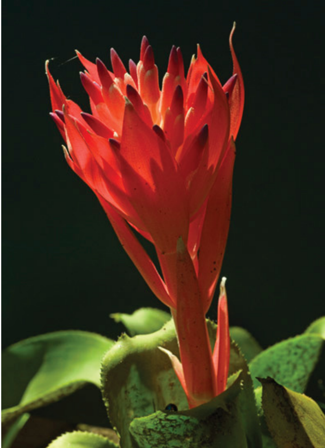
Here is the resulting photograph of the bromeliad taken with the Gitzo ball head. These bromeliads grow on the campus of the Francisco Marroquin University, in July, during the height of the annual rainy season.