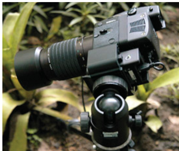
Manfrotto Ball Head 490