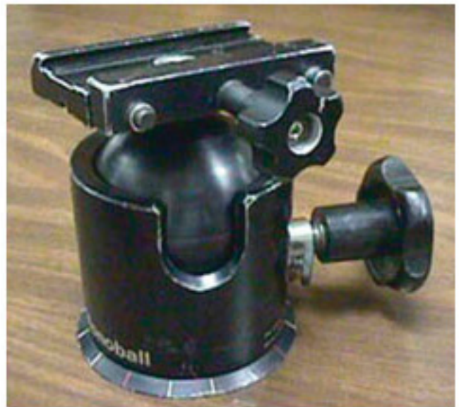
Arca Swiss Monoball