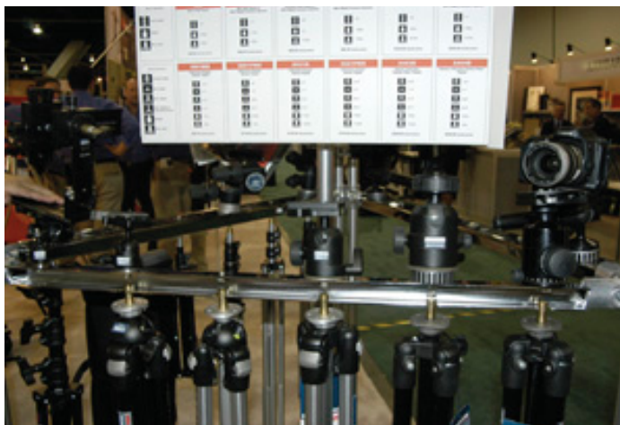
Manfrotto Ballheads Tripods at PotoPlus 2003