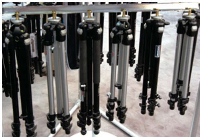
Manfrotto Ballheads Tripods at PMA 2004