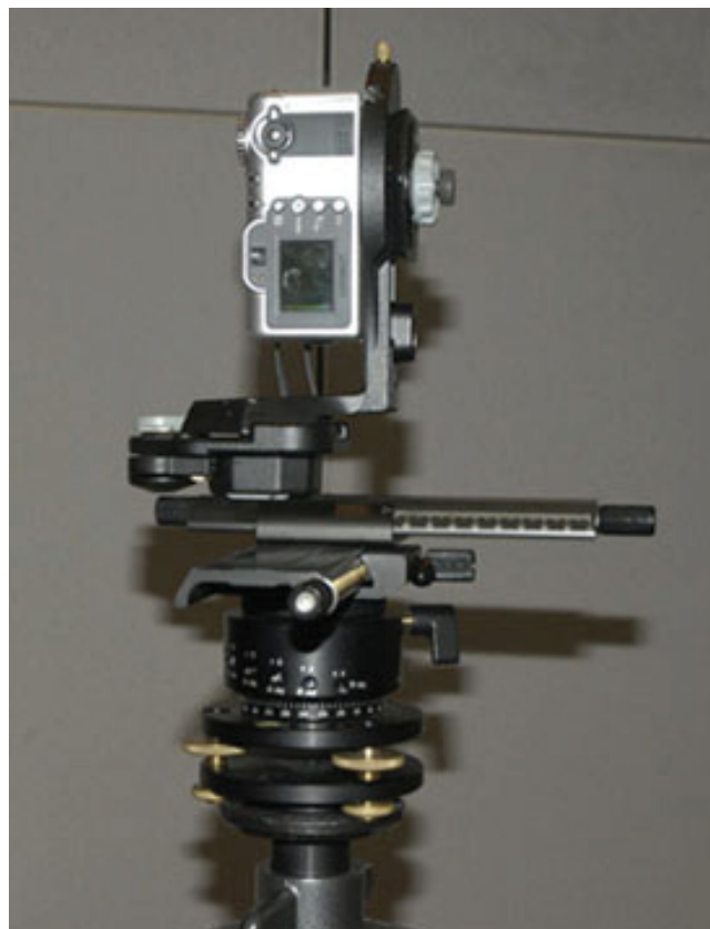
Manfrotto QTVR equipment, front and back