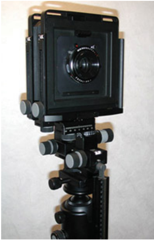
Arca Swiss Medium Format (4x5) camera