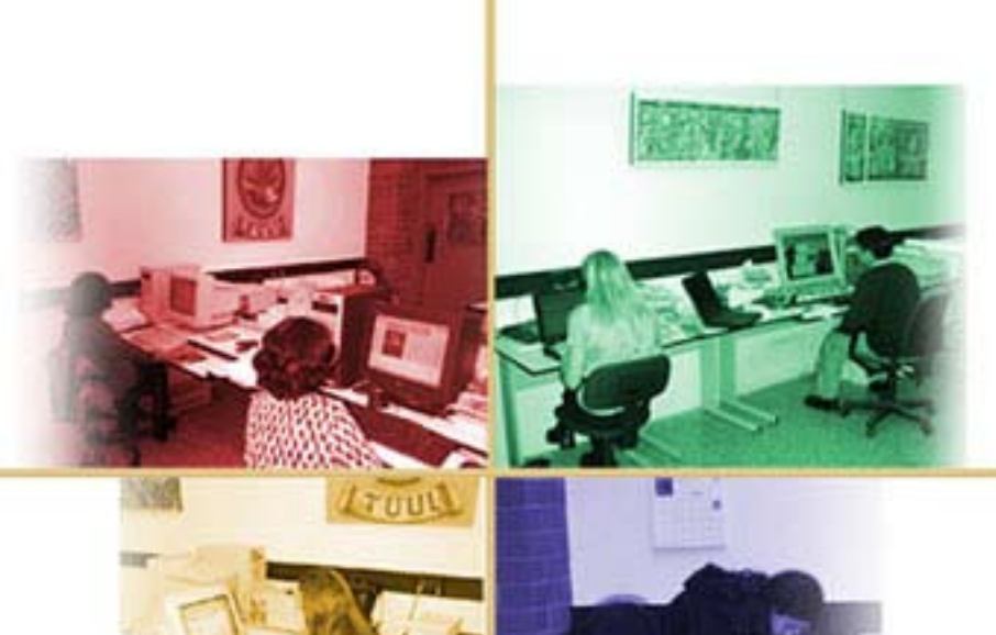
FLAAR staff receiving your Inquiry-Dialog forms and sending off the reports via Adobe Acrobat PDF format.