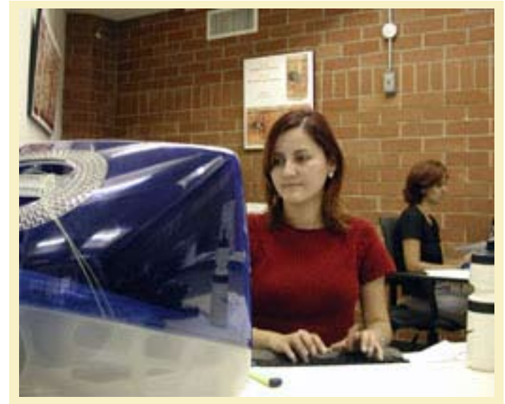
FLAAR support staff answering incoming e-mails by sending out appropriate abstracts, Reports, and information. FLAAR currently has 20 employees at two universities.

Hello, I think your page/organization its really great, sadly I buy my printer before I read your web page, so , now I have a X2 colorgrafx, and Im really dissapointed. The xerox service here is horrible.