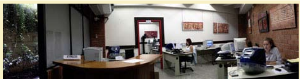
Panorama views of the front room and one of the interior areas of the FLAAR facilities, New Media Building, Francisco Marroquin University.