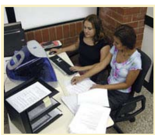
FLAAR staff trained in wide format printer markets and applications receive and answer incoming e-mails by sending out Abstracts and Reports.